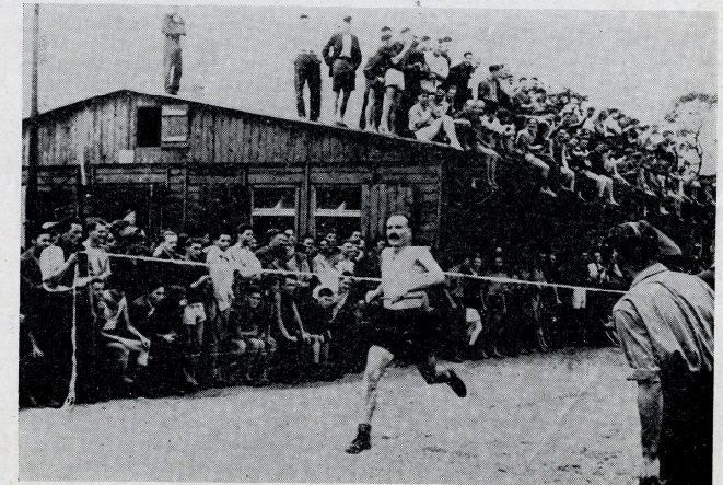
Sports Day at Stalag Luft III.