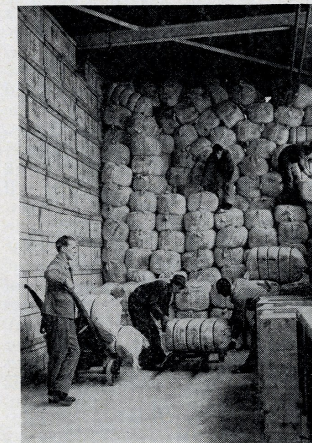
Bales and cases of clothing sent by the American Red Cross for prisoners of war are stored in bonded warehouses of the International Red Cross Committee awaiting rail transport from Switzerland to Axis camps.

Decided improvement, the report concludes, has been made at Camp No. 59 during the past year. The grounds, however, are still muddy after rain, but work is now in progress to improve this condition. A British prisoner writing from this camp last fall said: "The country looks lovely, and it is a jolly good tonic to see such a sight, especially the thousands of bunches of grapes hanging on the vines. We can buy grapes, pears, tomatoes, melons, peaches, etc., in the camp canteen."