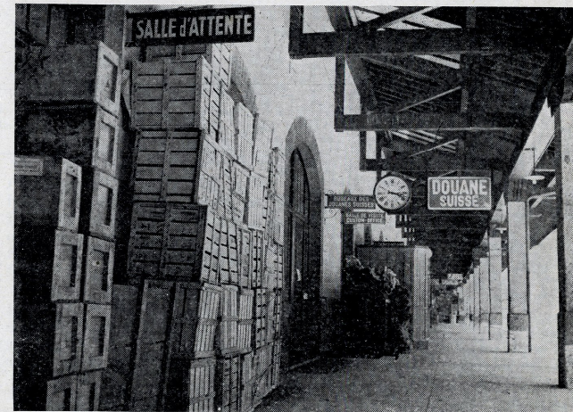
Swiss frontier station, once an important junction for international express and freight trains, is now used entirely for the storing and moving of prisoner of war supplies.

Oflag IX A/Z, Germany, now has a stage furnished by the Y. M. C. A., for amateur theatricals. Bernard Shaw's Man of Destiny , with a complete prisoner of war cast, was the first performance given on the new stage.