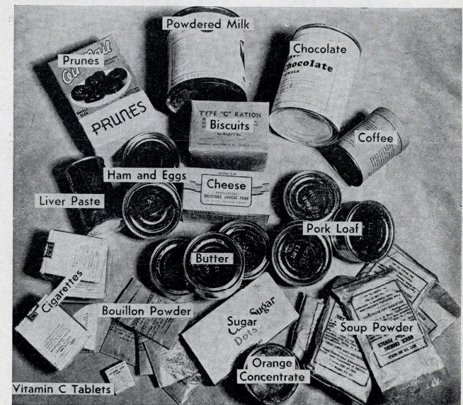
Contents of the invalid food parcel packed by Red Cross volunteers in the New York Packing Center. This parcel is for prisoners recovering from illness or wounds.