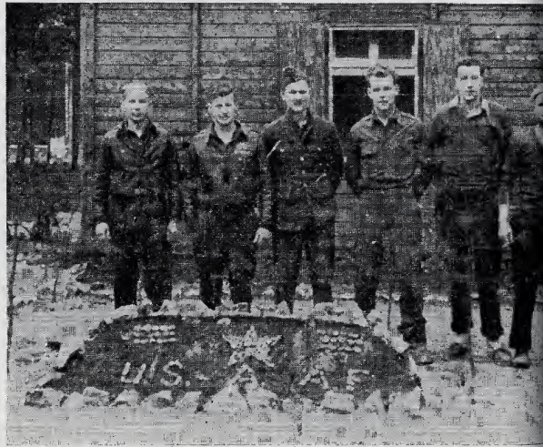
Group of American aviators, including at least two pilots of Flying Fortresses, are among the approximately four hundred American flyers at Stalag Luft III, Germany.

The following notes, taken from letters from prisoners of war in Italian camps, show that inter-camp news sheets there is just as common in German camps: "My first book review was published by the camp newspaper last week, and I hope to make regular contributions of this feature. The news which is posted, if it is from the Italian press, brings us details of conditions in England, as given by two of the who were brought down some time ago and are now at this camp. "The 'Grif' enters its third volume shortly. It is going strongly. We are running a series of motor racing articles which, with their illustrations, would do credit to any of the best motoring journals.