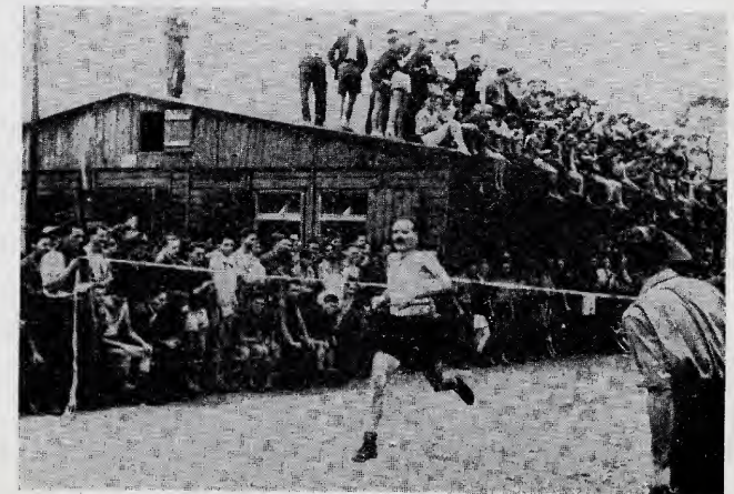
Sports Day at Stalag Luft III.