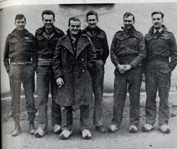
American "veterans" at Stalag Luft III. The wooden shoes worn by these flyers were issued by the German authorities. Many prisoners are said to prefer wooden to leather shoes for winter wear.

(Note: Many of the Japanese "camps" in industrial areas appear to be merely barracks or buildings used for housing prisoners of war rather than encampments. Ed.)