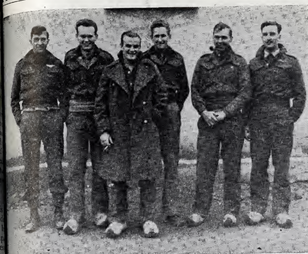
American "veterans" at Stalag Luft III. The wooden shoes worn by these flyers were issued by the German authorities. Many prisoners are said to prefer wooden to leather shoes for winter wear.

(Note: Many of the Japanese "camps" in industrial areas appear to be merely barracks or buildings used for housing prisoners of war rather than encampments. Ed.)