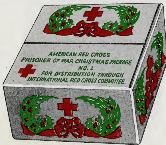
Ten thousand of these special packages were shipped to Europe for distribution to American prisoners at Christmas.

specially made up to meet exceptional requirements. These Gripsholm supplies, which were transferred to a Japanese ship at Morningao under International Red Cross Committee supervision, were unloaded during November at the designated points in the Far East. Assuming no undue delays have occurred, there has thus been ample time for the food, clothing, medicines, and other supplies to reach the men in the Far East camps by Christmas.