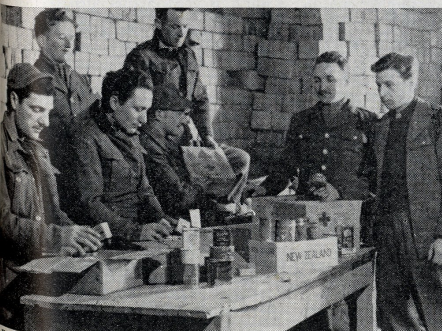
Examining New Zealand and American Red Cross packages in the Vorlager.