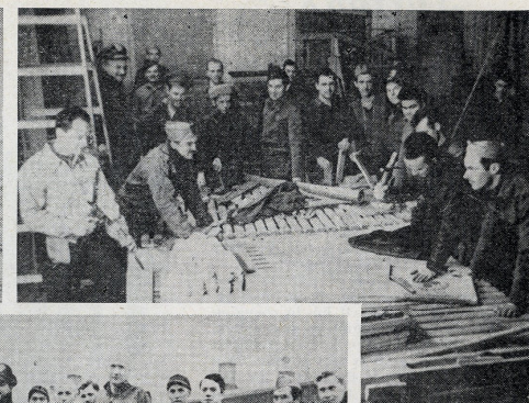
Backstage in the new theater. Wood from Red Cross boxes and camp-made tools are used in making props and scenery.