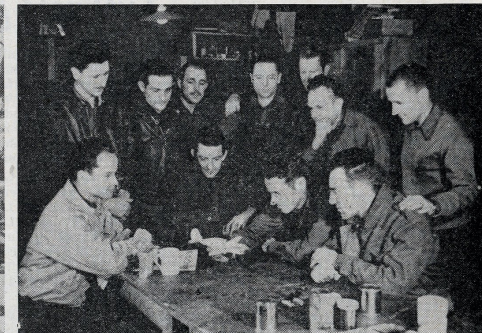
Prisoners study model planes made in the camp.