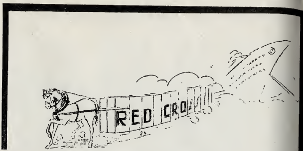
Red Cross shipments to Stalag II B are featured in the masthead of the camp newspaper, "Barbs and Gripes."