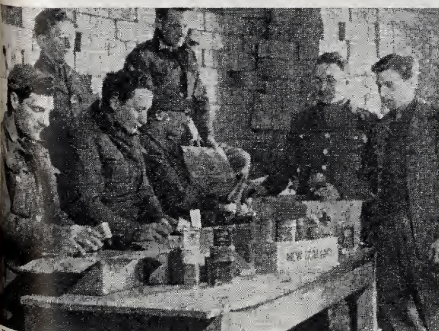
Examining New Zealand and American Red Cross packages in the Vorlager.