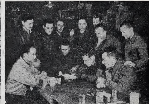
Prisoners study model planes made in the camp.