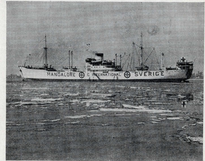
The new Motorship "Mangalore" reaching Philadelphia last January on her first crossing of the Atlantic