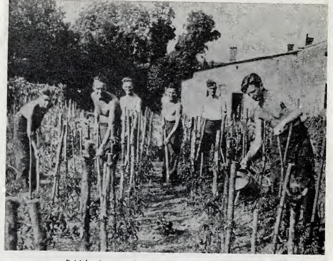
British prisoners cultivating tomatoes at Stalag XXI A.

This will be more good news for you at ands per month, so you'll hear from me once week from now on. We all are looking forhard to our return as this life is very monot-