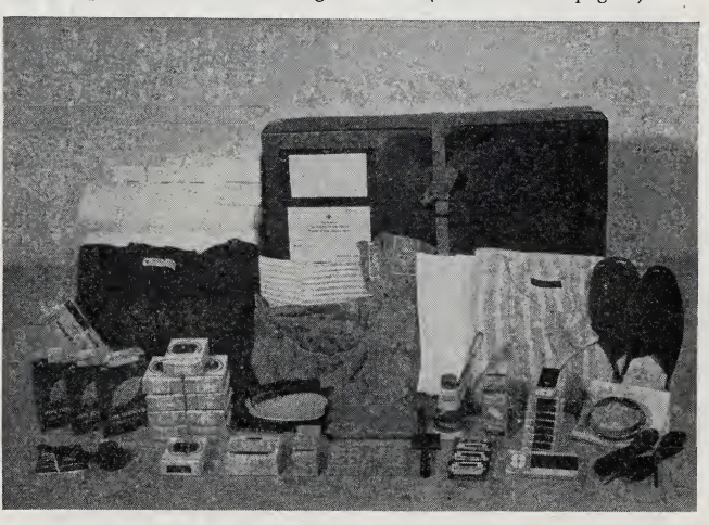
Ten thousand capture parcels have been forwarded from Geneva to camps in Germany for American prisoners of war, and a second shipment of ten thousand (contents as above) is now on its way from the United States to Geneva.