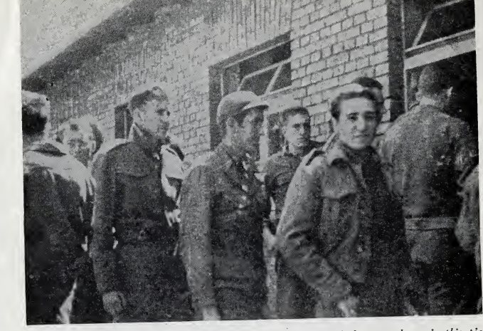
Americans at Stalag III B line up for "chow." The names of the men shown in this pic-ture were not furnished to the American Red Cross.

Toward the end of 1943 a large umber of American prisoners of ar were assigned to Stalag XVII B, Tred from Stalag VII A, which is ow being used mainly as a transit mp. Stalag XVII B formerly conaned Russian prisoners, and, as ere were no relief supplies for ericans on hand there, a shipment promptly sent from Stalag VII A. large consignment of standard and Packages was sent from Switzer-and on November 30 and reached <sup>talag</sup> XVII B on December 18. Cothing and comfort articles were