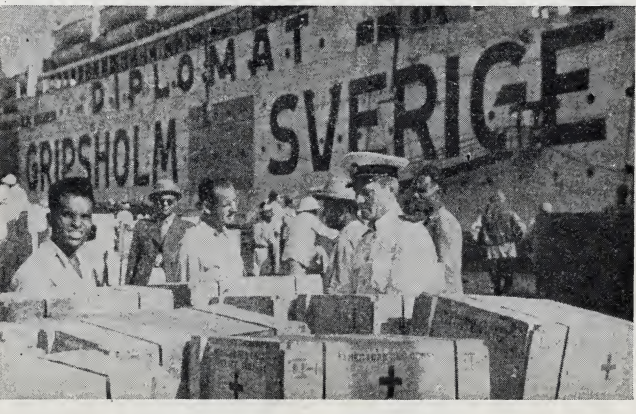
Transshipment at Mormagao, in Portuguese India, of Red Cross supplies from the "Gripsholm" to the Japanese ship, "Teia Maru."

3. Offered to turn over to the Japanese Red Cross an American ship in mid-Pacific, to be taken over by a Japanese crew, for the movement of American relief supplies, but to no avail.