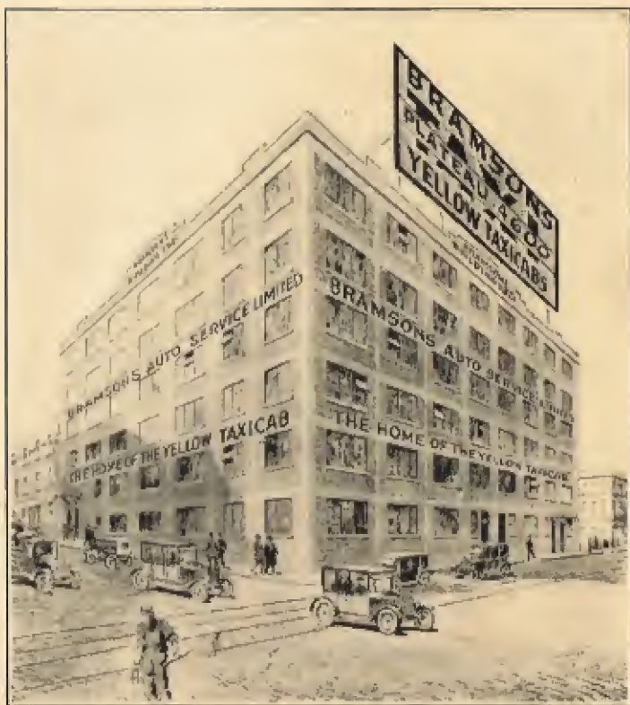
BRAMSONS AUTO SERVICE Limited MANCE AND ONTARIO STS. MONTREAL