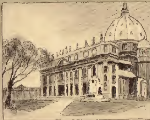
St. James Cathedral.

S T. JAMES' CATHEDRAL is a copy of St. Peter's of Rome, of which it is half the dimensions. The Cathedral is built in the form of a cross, 330 feet long and 222 wide. Over the portico will be noticed thirteen statues in bronze. These were donated by different parishes. The names of the statues are as follows: St. James, St. Joseph, St. Anthony of Padua, St. Francis of Assisi, St. Vincent de Paul, St. John the Evangelist, St. Paul, St. Thomas Aquinas, St. Patrick, St. Charles Borromée, St. John the Baptist, St. Hyacinth, and St. Ignatius. The dome is 70 feet in diameter at its base and its summit is 210 feet from the spectators on the floor of the Church. It is an exact copy of its famous prototype in Rome.