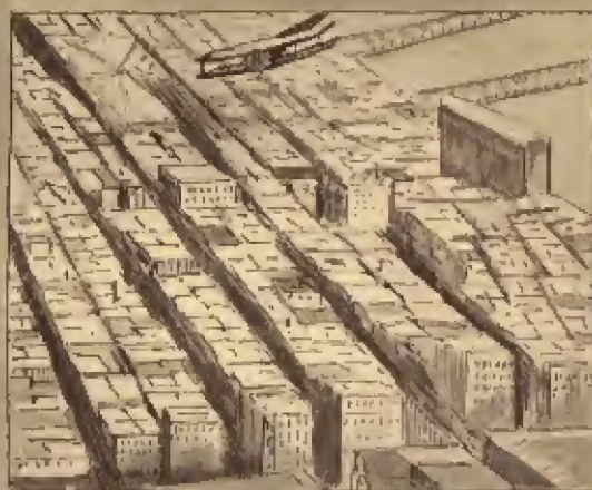
Seen by Aeroplane

At one time Montreal's finest homes were situated on this boulevard and while to-day it is no less exclusive, this popularity is shared with other portions of the City.