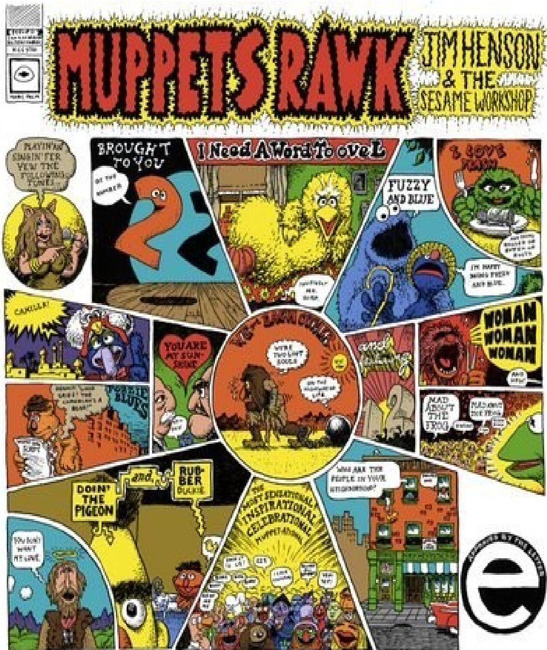
Just Cos I thought you might like this muppets tribute to the album cover 'Cheap Thrills' Originally drawn by Robert Crumb for the Janis Joplin Band.