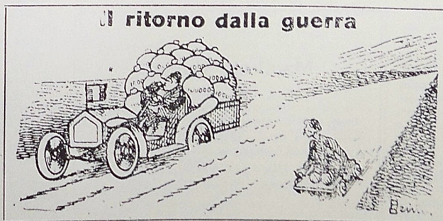
THE RETURN FROM THE WAR

The workers possess the power. They must use the power. Capitalism must not put it over. The proletariat must rally to the cause and the struggle of international communist Socialism.