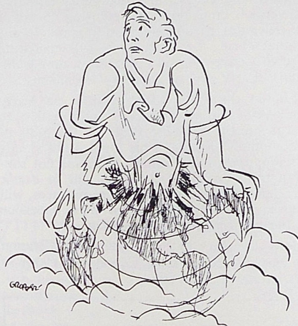
The Upsurge of Socialism

The report of the Credentials Committee recommended the seating of 66 delegates from 14 states (other delegates being seated at sub-