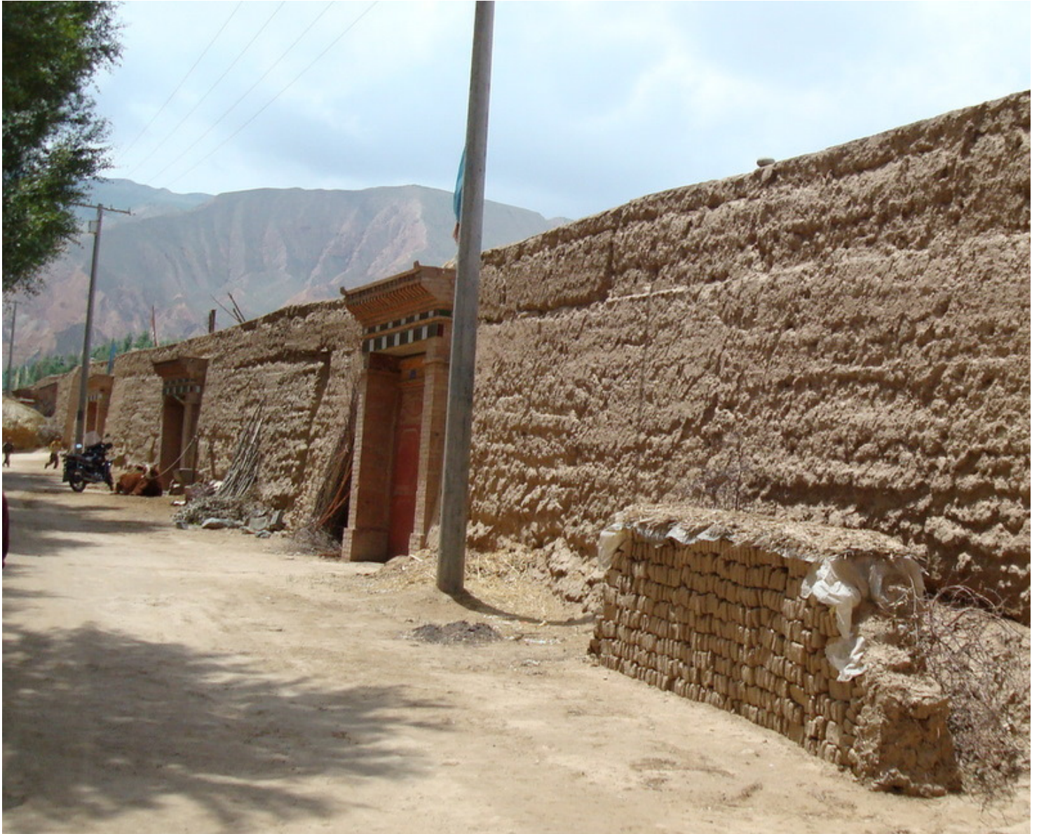
Several village households