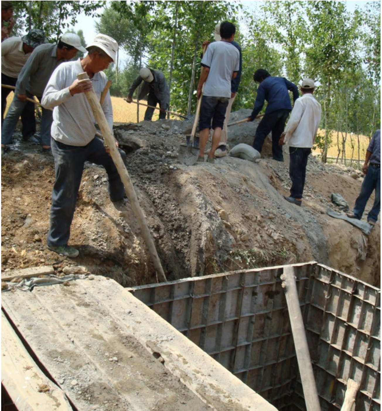
Villagers work on the water box reservoir.