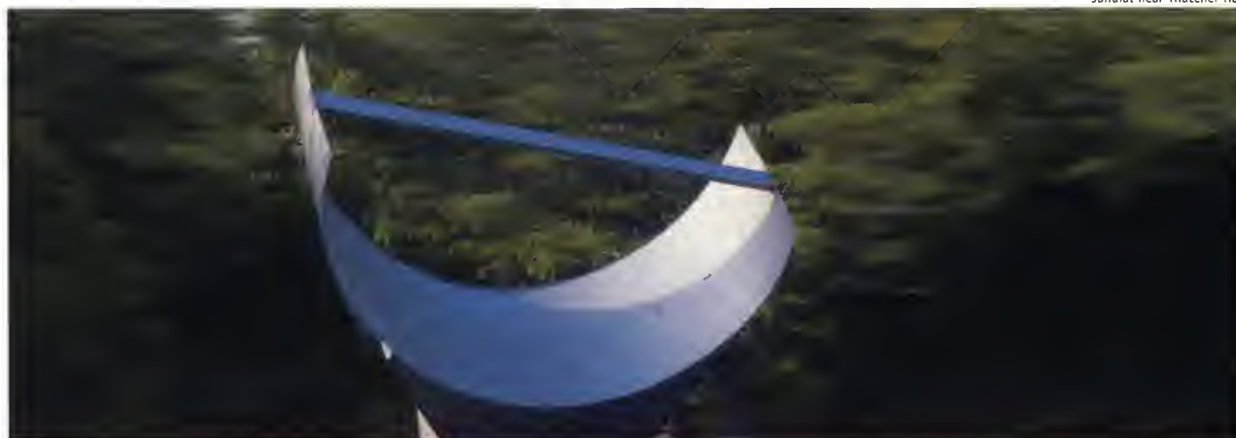
sundial near Thatcher Hall

So teach us to number our days, that we may apply our hearts unto wisdom