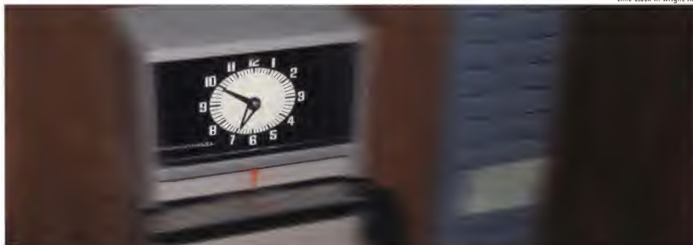
time clock in Wright Hall

Time is the most valuable thing a man can spend.