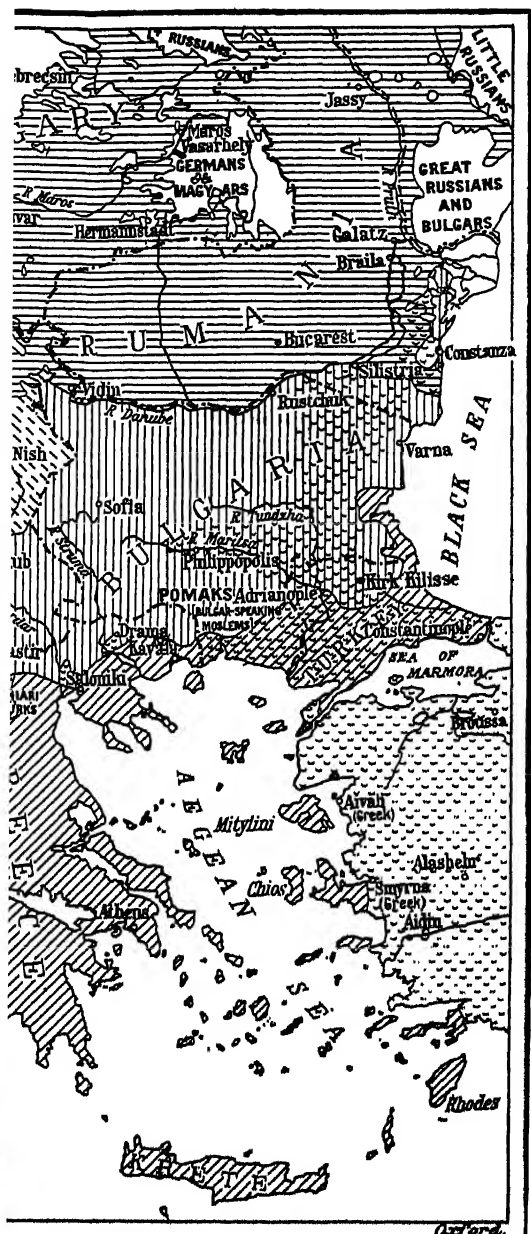
THE BALKAN PENINSULA ETHNOLOGICAL