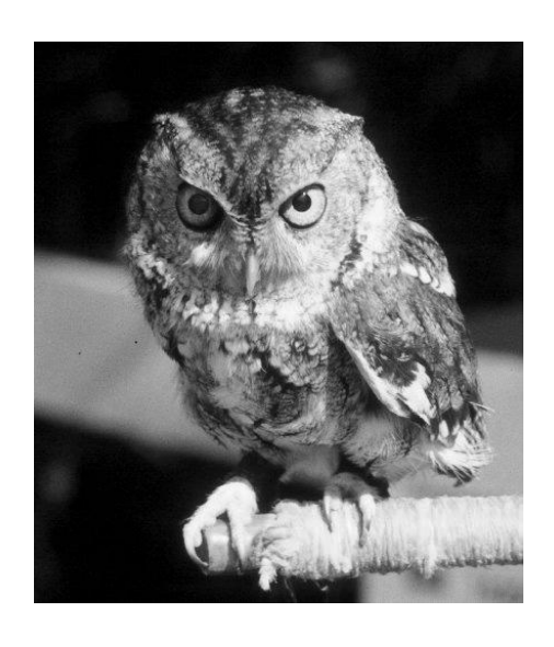
The Greyling Owl