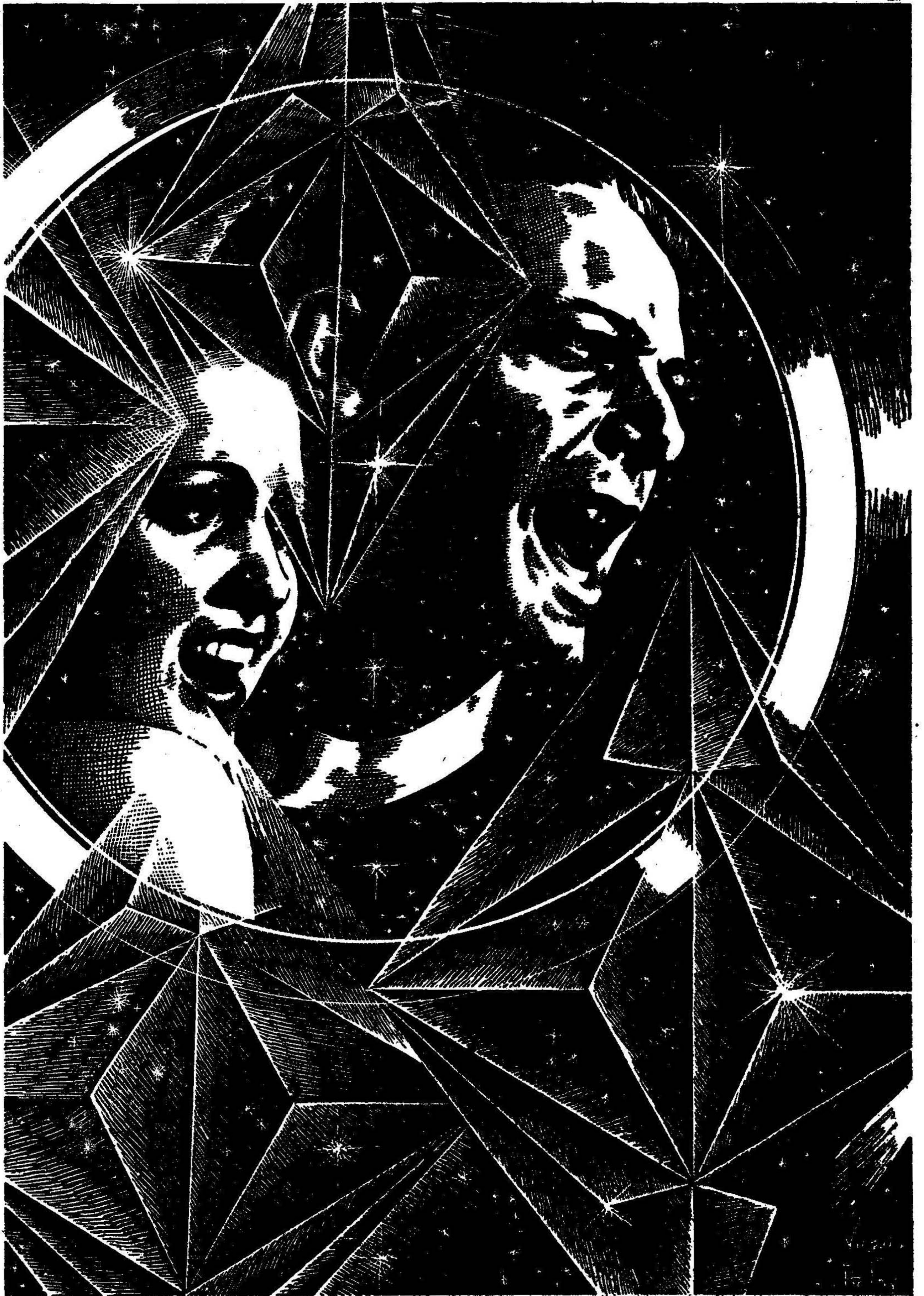
There beside Thela, Carl waited for the ripping explosion which would send them into nothingness