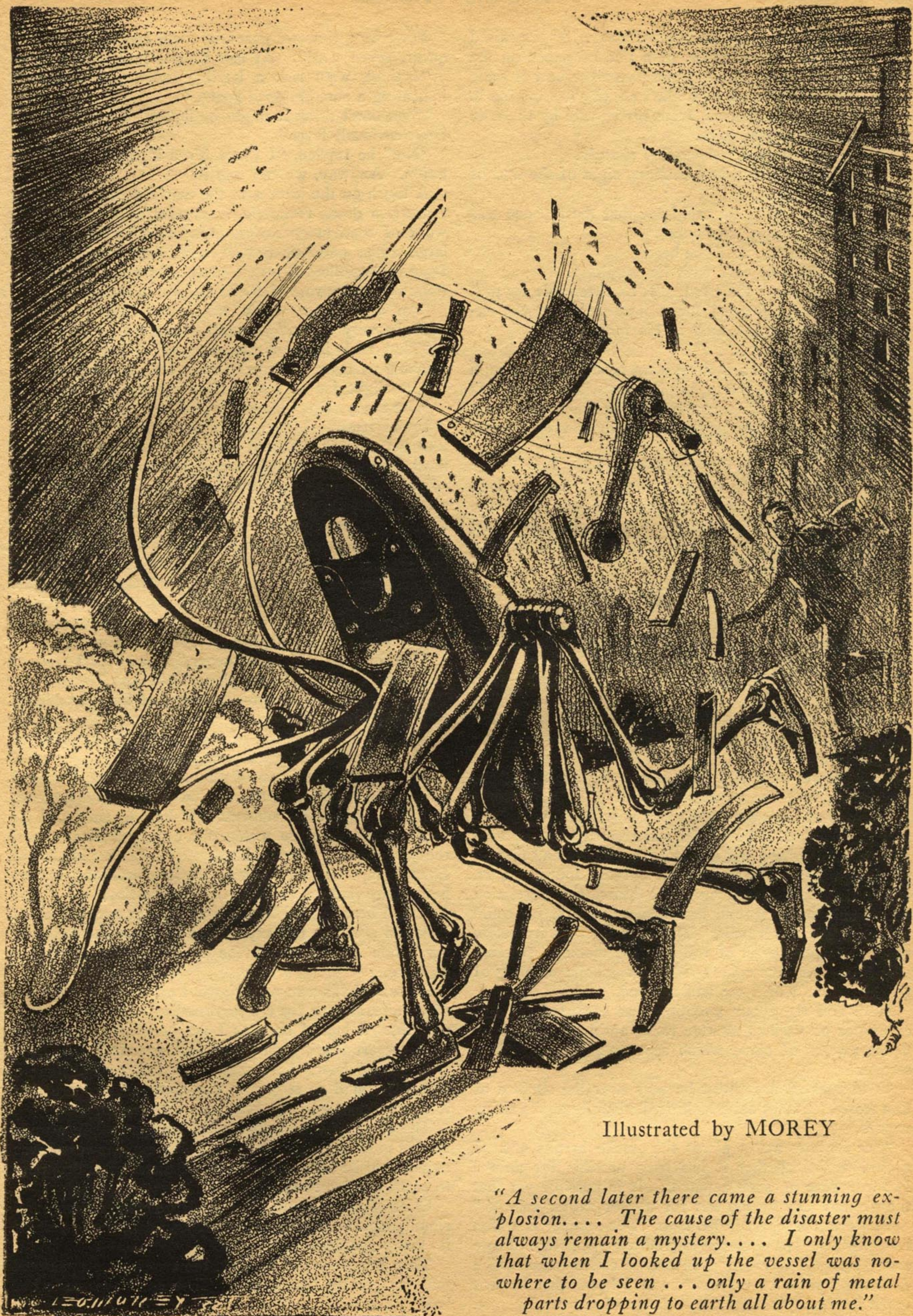
Illustrated by MOREY

"A second later there came a stunning explosion. . . . The cause of the disaster must always remain a mystery. . . . I only know that when I looked up the vessel was nowhere to be seen . . . only a rain of metal parts dropping to earth all about me."