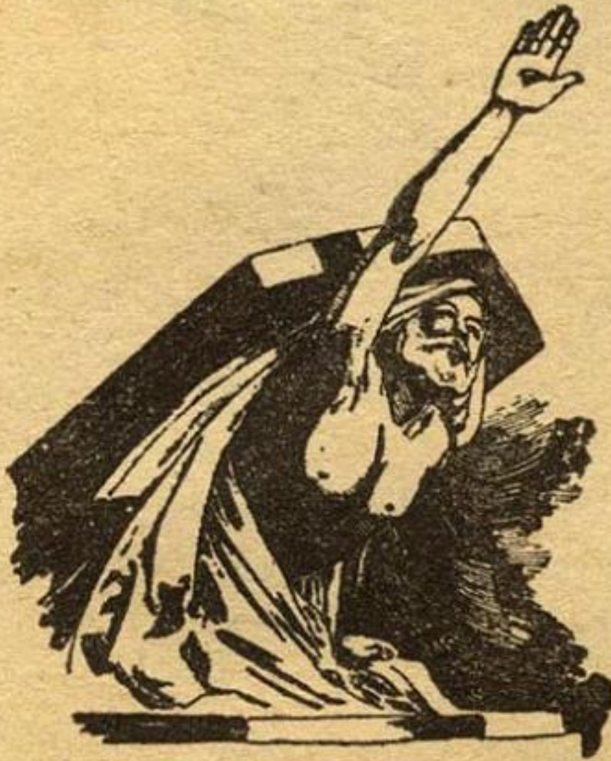
JULES VERNE'S TOMBSTONE AT AMIENS PORTRAYING HIS IMMORTALITY