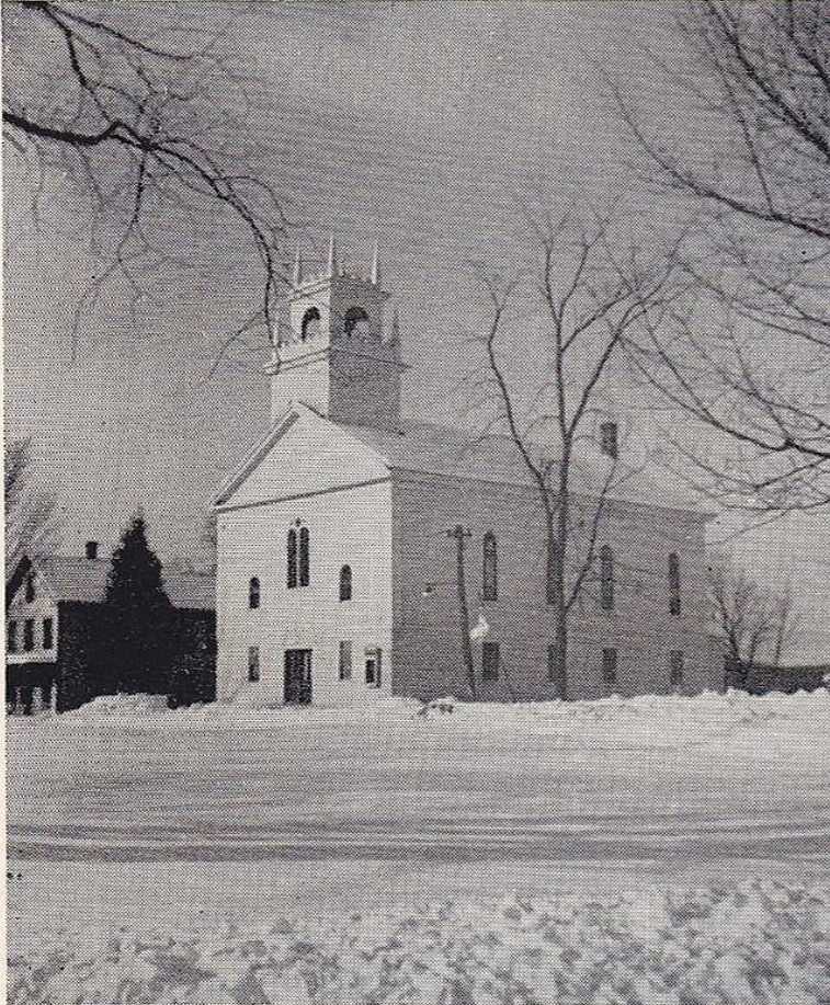
The Old Baptist Meeting House, West Swanzey, where the Old Homestead Sunday Service will be held at 11 a.m., July 31.

PREVIOUS to the year 1880 little is known of the history of the Baptist Meeting House as it came to be known in later years. However, what little information we have concerning it would indicate that it really came into being in the year 1792 with twenty-five charter members.