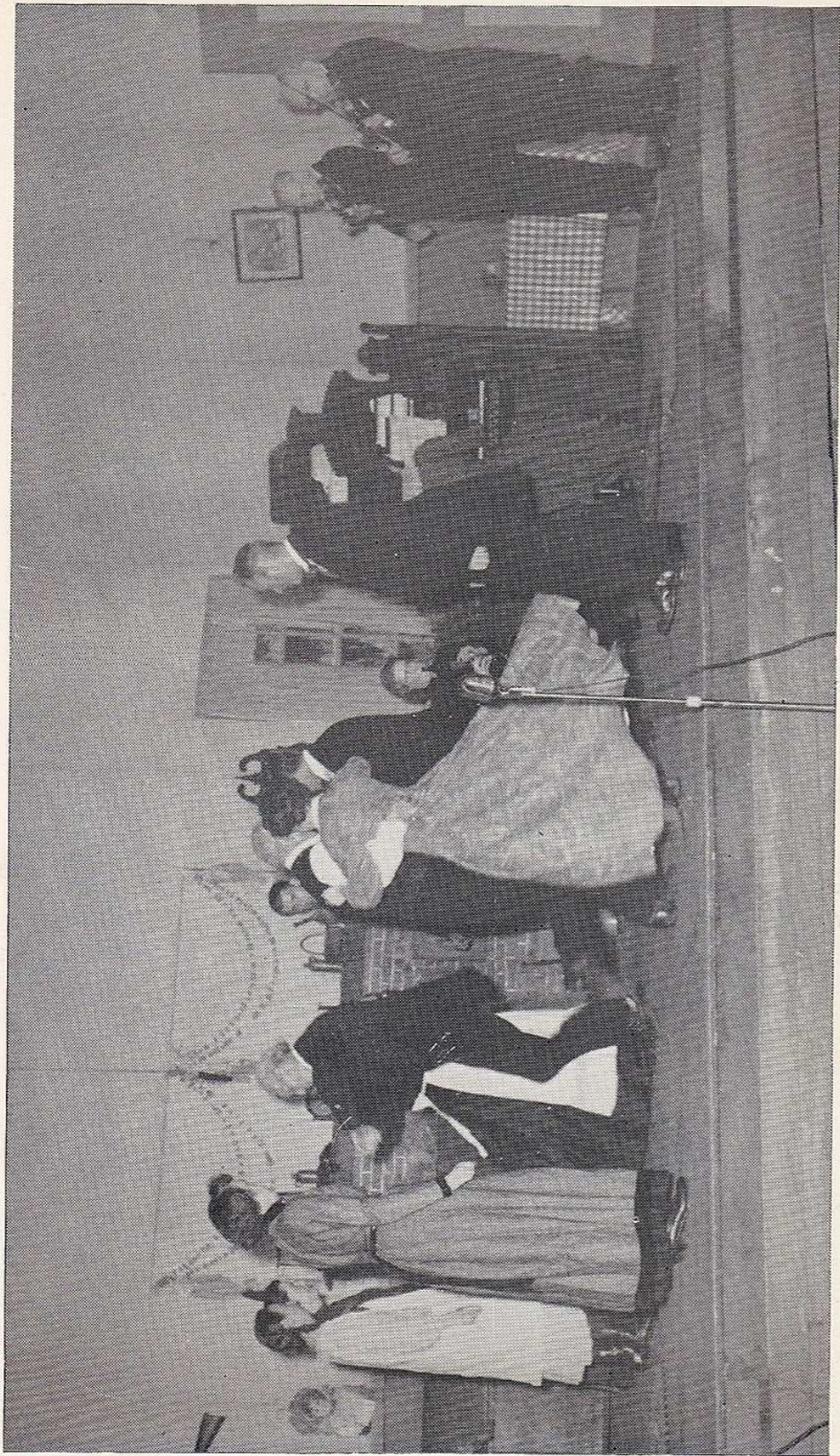
And There was Music and Dancing in the House