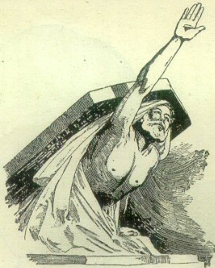
JULES VERNE'S TOMBSTONE AT AMIENS PORTRAYING HIS IMMORTALITY