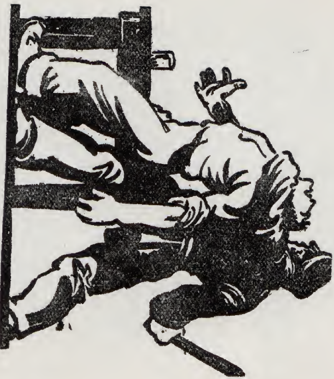
Capitalist "democracy, freedom of speech and justice for all;"

Gastonia is but the outstanding symbol of the developing class struggle throughout the United States and the world.