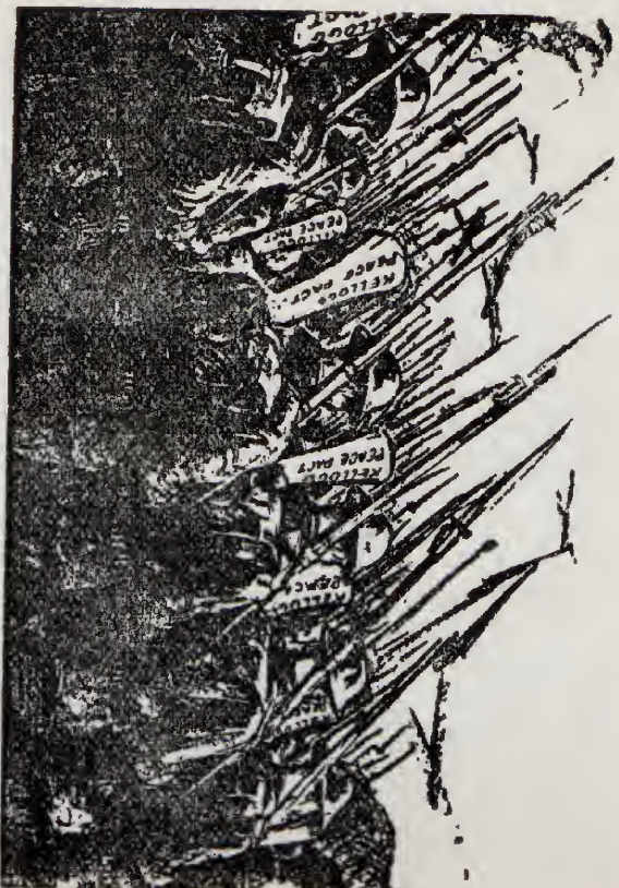
A copy in each knap-sack.

By joining the Communist Party you not only strengthen the American working class but also help the workers of the Soviet Union in their tremendous tasks of the construction of socialism. At the same time you are building up the power which alone can defend the Soviet Union against imperialist war—the power of the international organized working class.