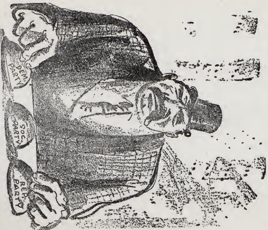
The Old Shell game—all three are his obedient servants

This is true of the socialist party of each country. In England it is the Labor Party which, with MacDonald at its head, is carrying on the capitalist government upon the same line as Baldwin the Conservative; breaking strikes, helping the bosses cut wages and speed up the machines; suppressing the colonial peoples; massacring Arabs and Indians; sending labor organizers in India to prison; helping suppress the Chinese Revolution; and preparing further for imperialist war against the Soviet Union and among the imperialist powers. In Germany the Social-Democratic government of Mueller is completing its evolution