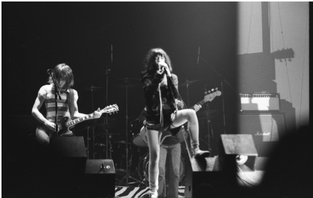
Patti Smith - Dec 19, 1976 Seneca College - $7.50

At this show, there was a claim, and some folks insisted she had pissed herself onstage towards the end of the tune "Pissing In A River". I don't recall this but then again, it was 30 odd years ago.