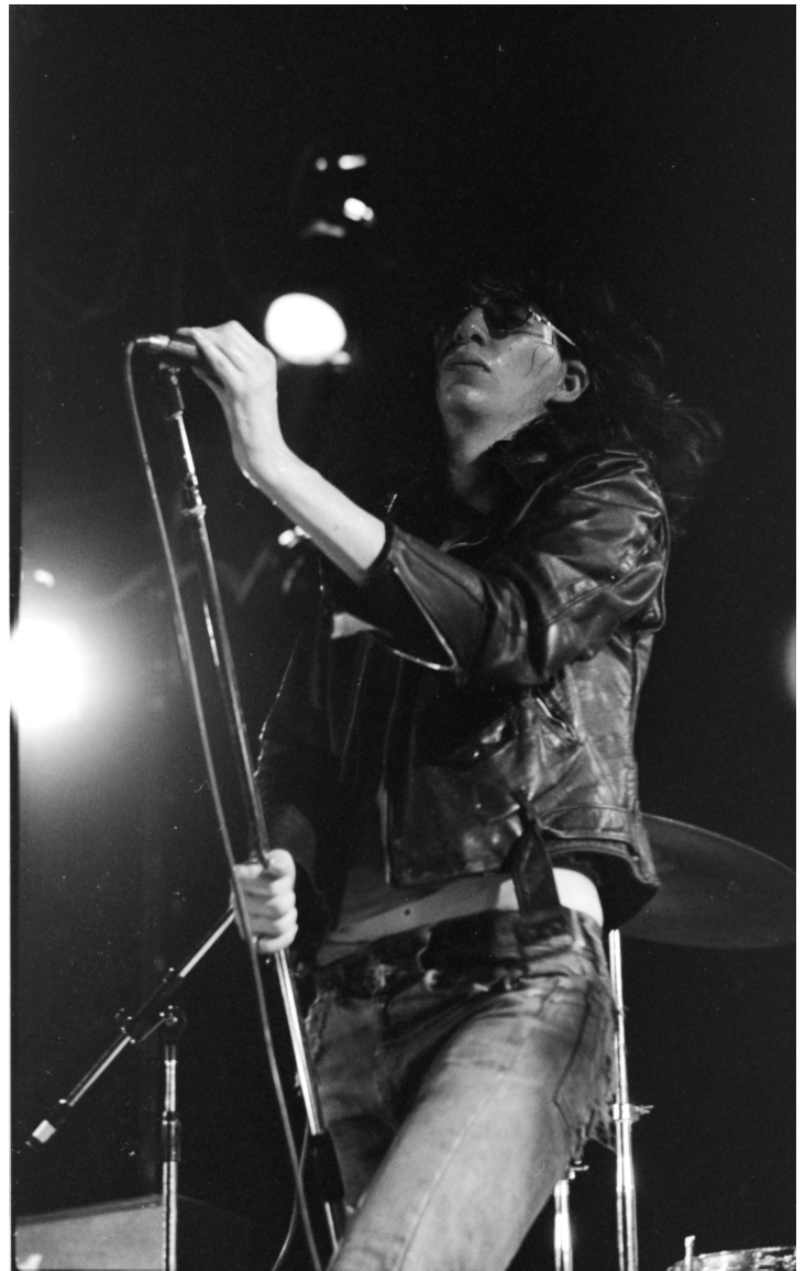
The Ramones - Sept 25 1976 New Yorker Theatre - $5.50

At this show, there was a claim, and some folks insisted she had pissed herself onstage towards the end of the tune "Pissing In A River". I don't recall this but then again, it was 30 odd years ago.