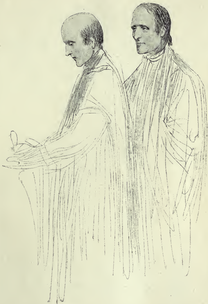
CARDINAL MANNING SAYING HIS FIRST MASS AT FARM STREET, JUNE 16, 1851.