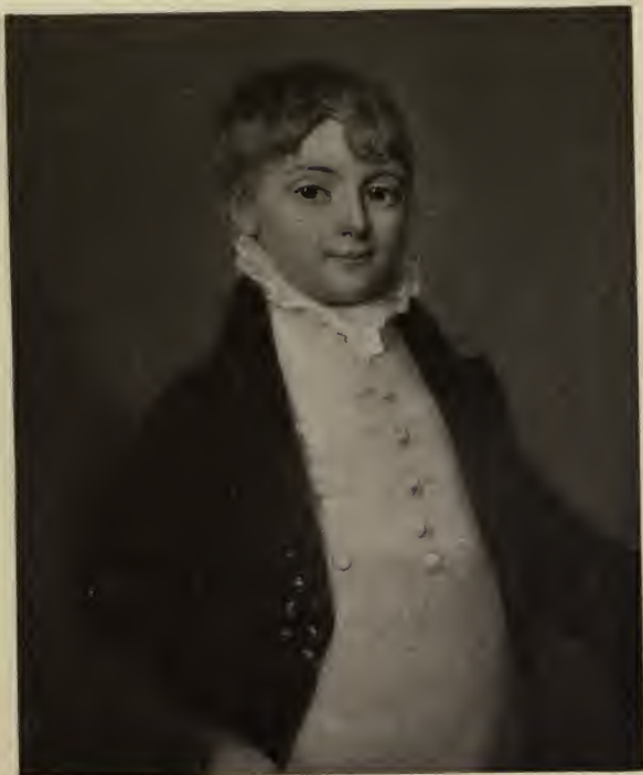
Cardinal Manning as a Harrow boy, about 1820