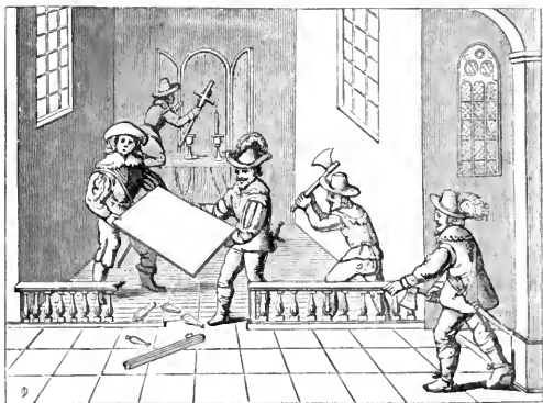
CROMWELL'S SOLDIERS DEMOLISHING THE FURNITURE AND ORNAMENTS OF A CHURCH.