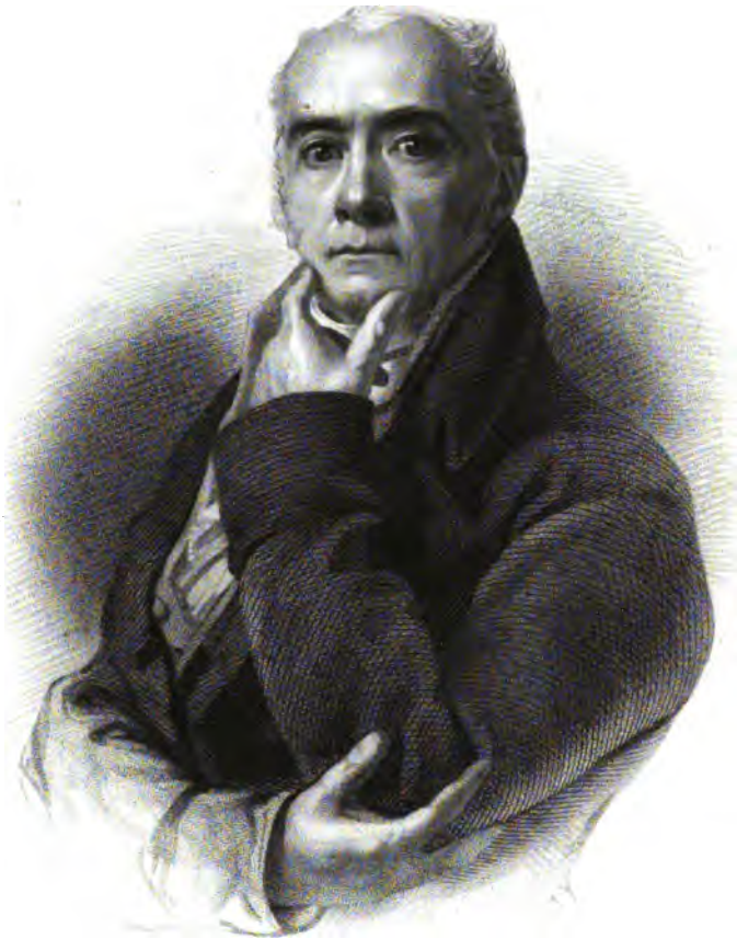
Painted by Sir H. Raeburn