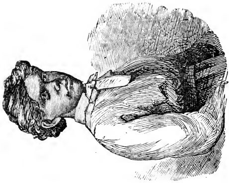
NATIVES EDUCATED AT POONINDIE, 1858.