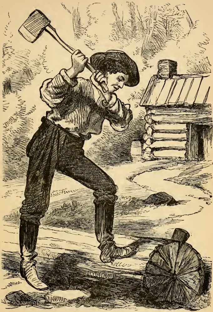
THE YOUNG RAIL SPLITTER. Page 57.