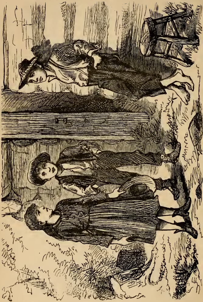
ABE'S EARLY HOME, THE LOG CABIN. Page 9.