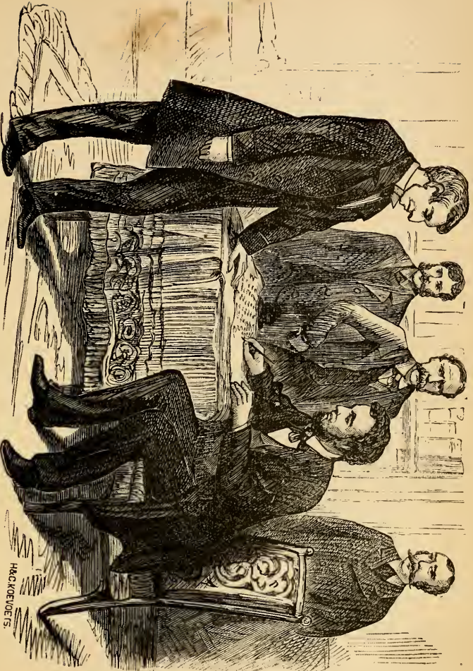
ABRAHAM LINCOLN, SIGNING THE EMANCIPATION PROCLAMATION. PAGE 267.