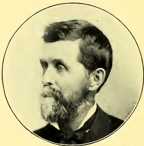
JUDGE FRANKLIN BLADES