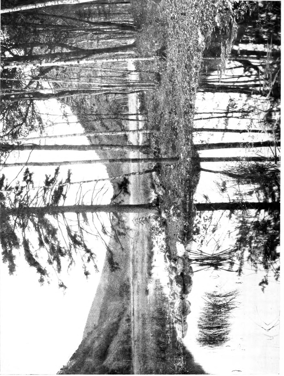
A delightful water garden in the national park, formed by glacial erosion and later soil and peat deposit