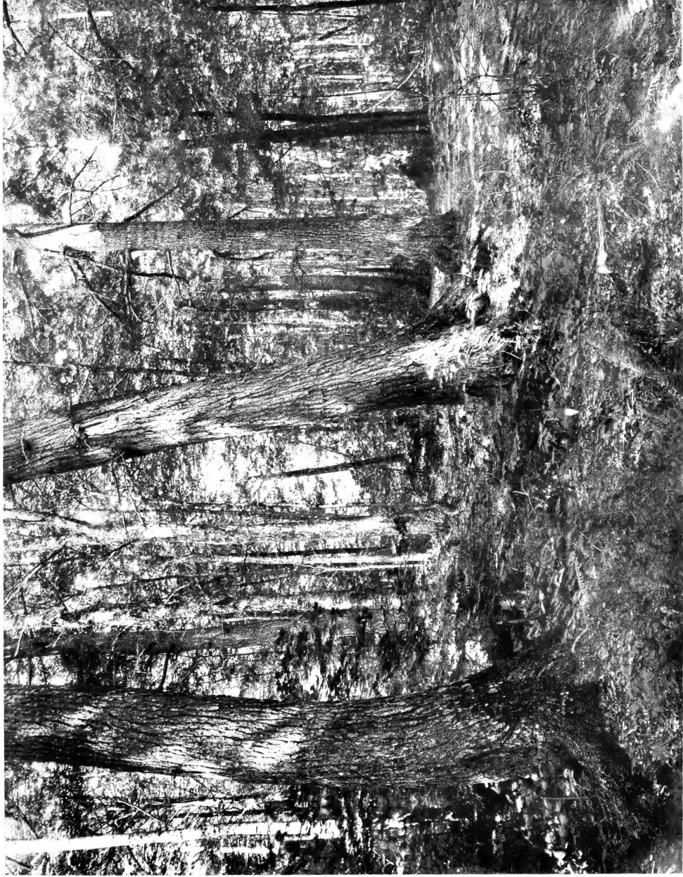
Primeval hemlocks growing on lands belonging to The Wild Gardens of Acadia which form one of the approaches from Bar Harbor to the national park