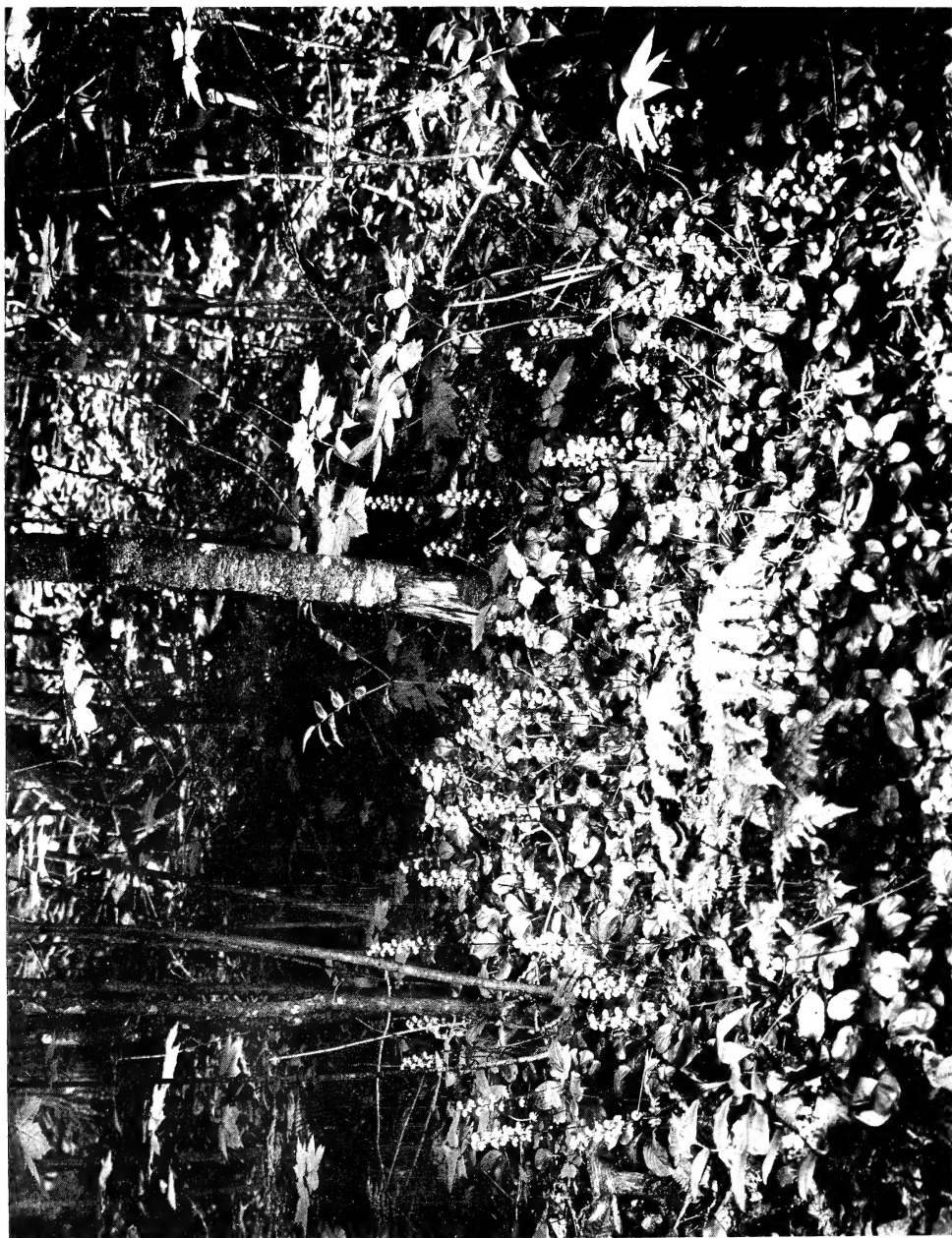
Wild flowers in national park woods upon Mount Desert Island. The plant is Pyrola elliptica