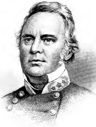
GEN. STERLING PRICE.