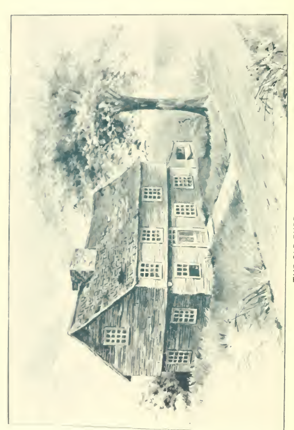
THE OLD BURBEEN HOUSE, WOBURN, MASS.