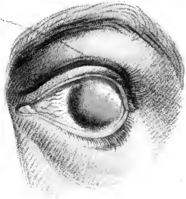
Fig. 3 d