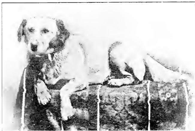
ABRAHAM LINCOLN'S DOG, FRITZ.