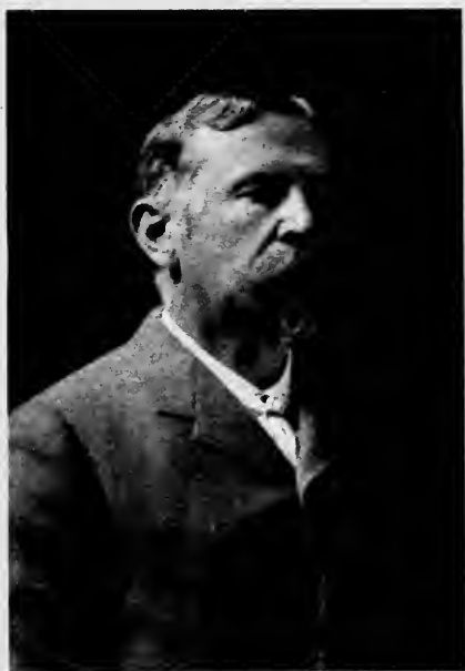
H. L. II.