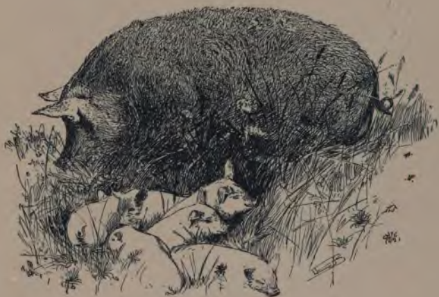
YE DELIGHTFUL FIG.