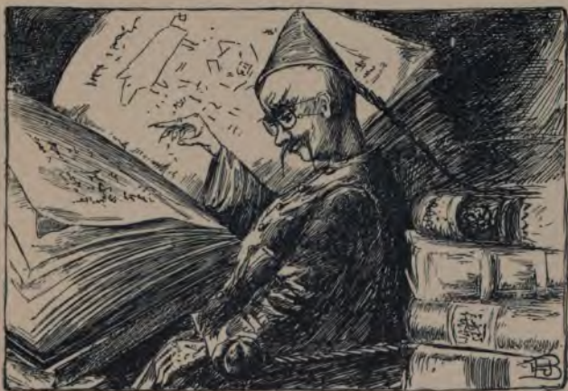
YE SAGE MAKETH A DISCOVERY.