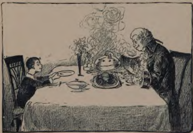
YE AROMATIC FIG.