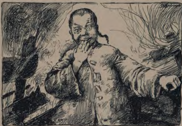
YE FIRST TASTE.