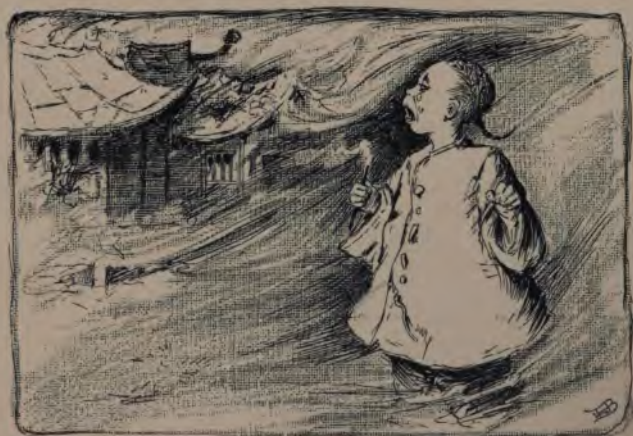
BO-BO PLAYETH WITH FIRE.