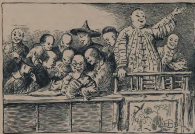
YE JURY GIVETH ITS VERDICT.