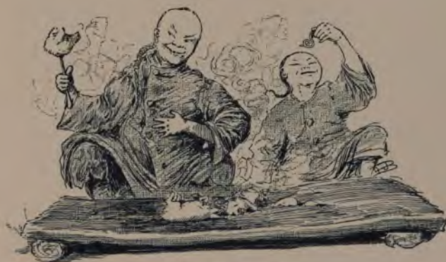
YE FAMILY REJOICETH.