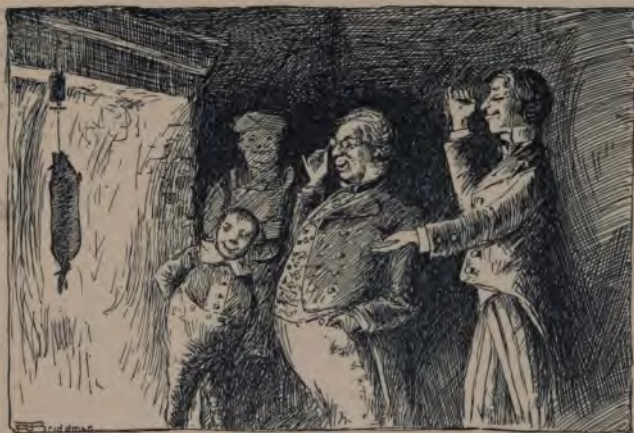
YE FIG TWIRLETH.