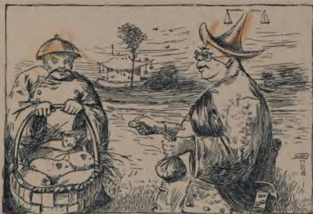
YE JUDGE SPECULATETH.