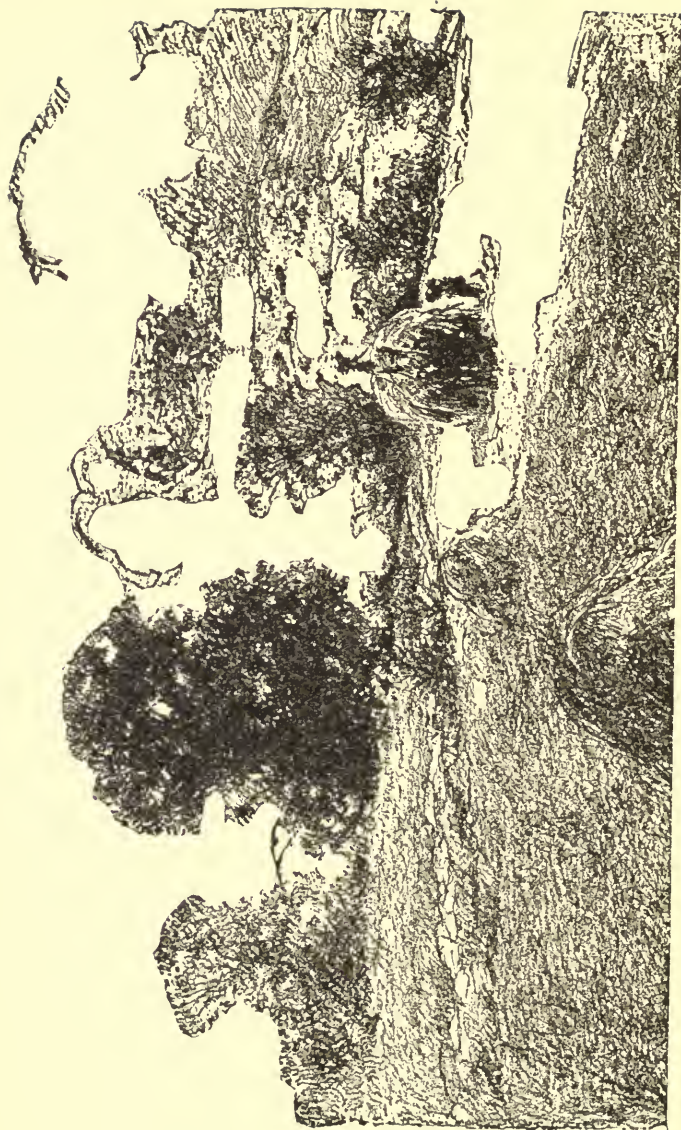
“HOW GRACEFUL CLIMB THESE SHADOWS ON MY HILL.”