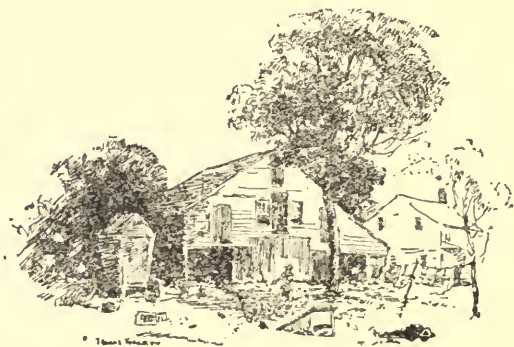
The barn yard