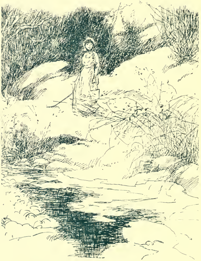
“ THE PLACE OF THE RUSHES AND THE FLAGS ”