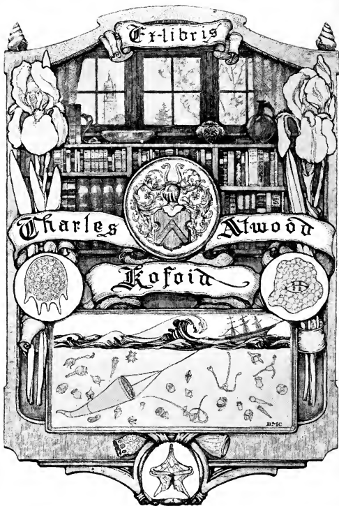
BL. bookplate on back cover