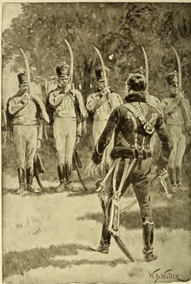
“ WITH ONE IMPULSE THE TWELVE SWORDS FLEW FROM THEIR SCABBARDS AND WERE RAISED IN SALUTE.”