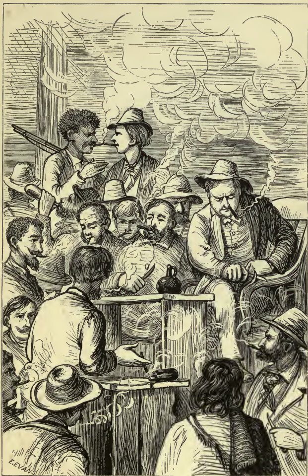
“The attorney, on his legs. addressing the jury, was also smoking.”