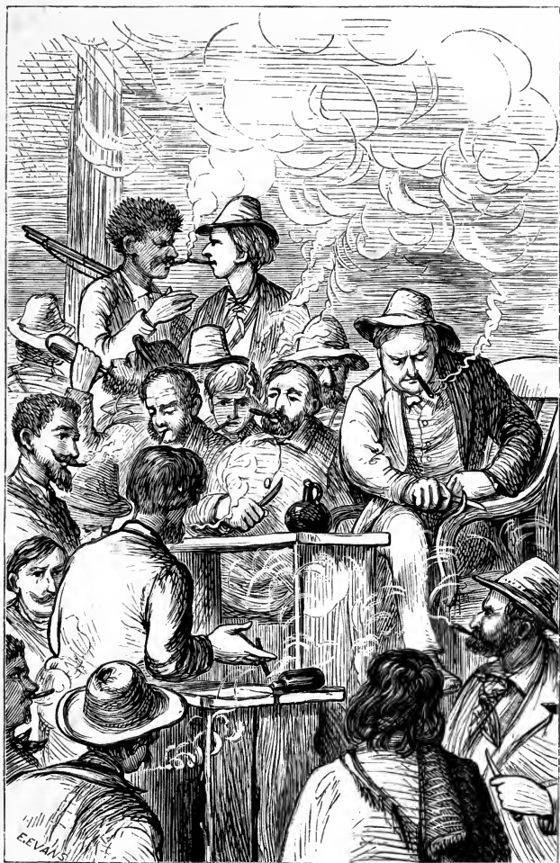
“The attorney, on his legs. addressing the jury, was also smoking.”