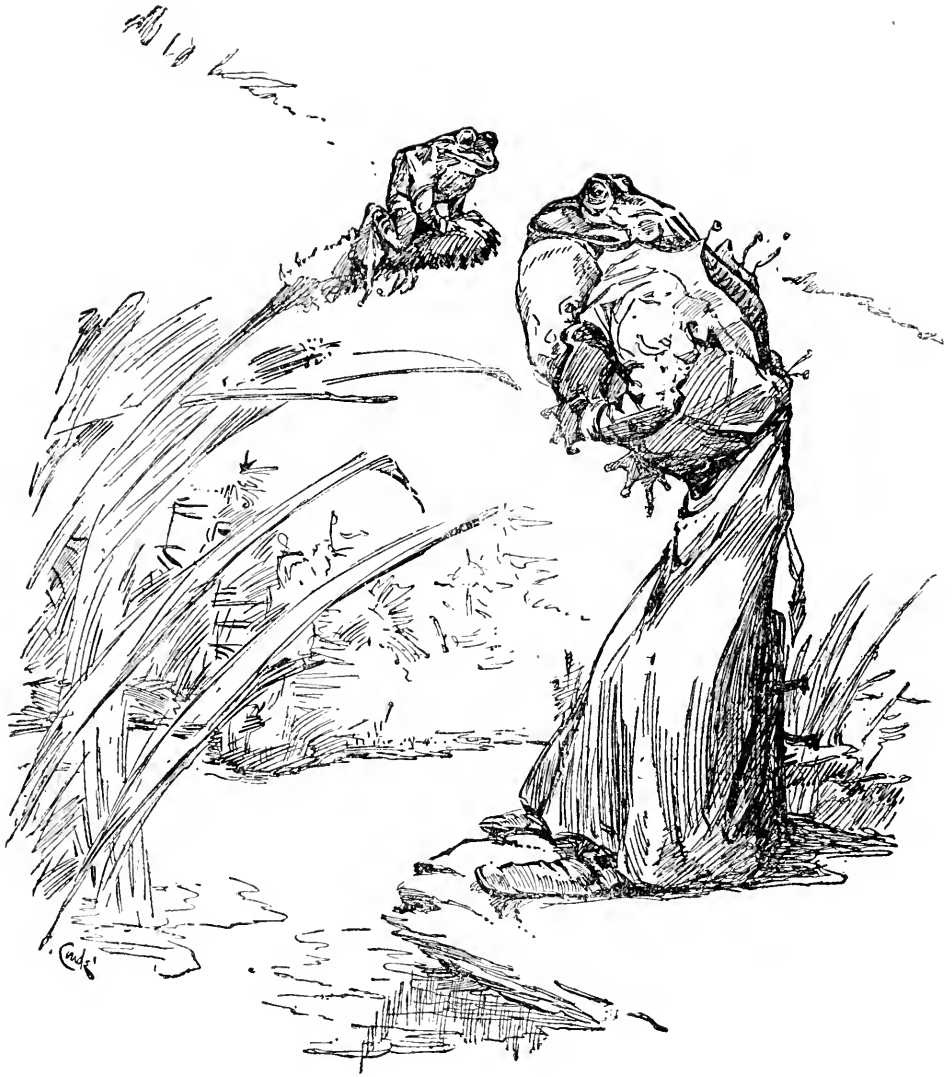
THE OX AND THE FROG