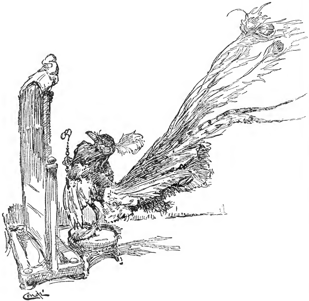
THE VAIN JACKDAW