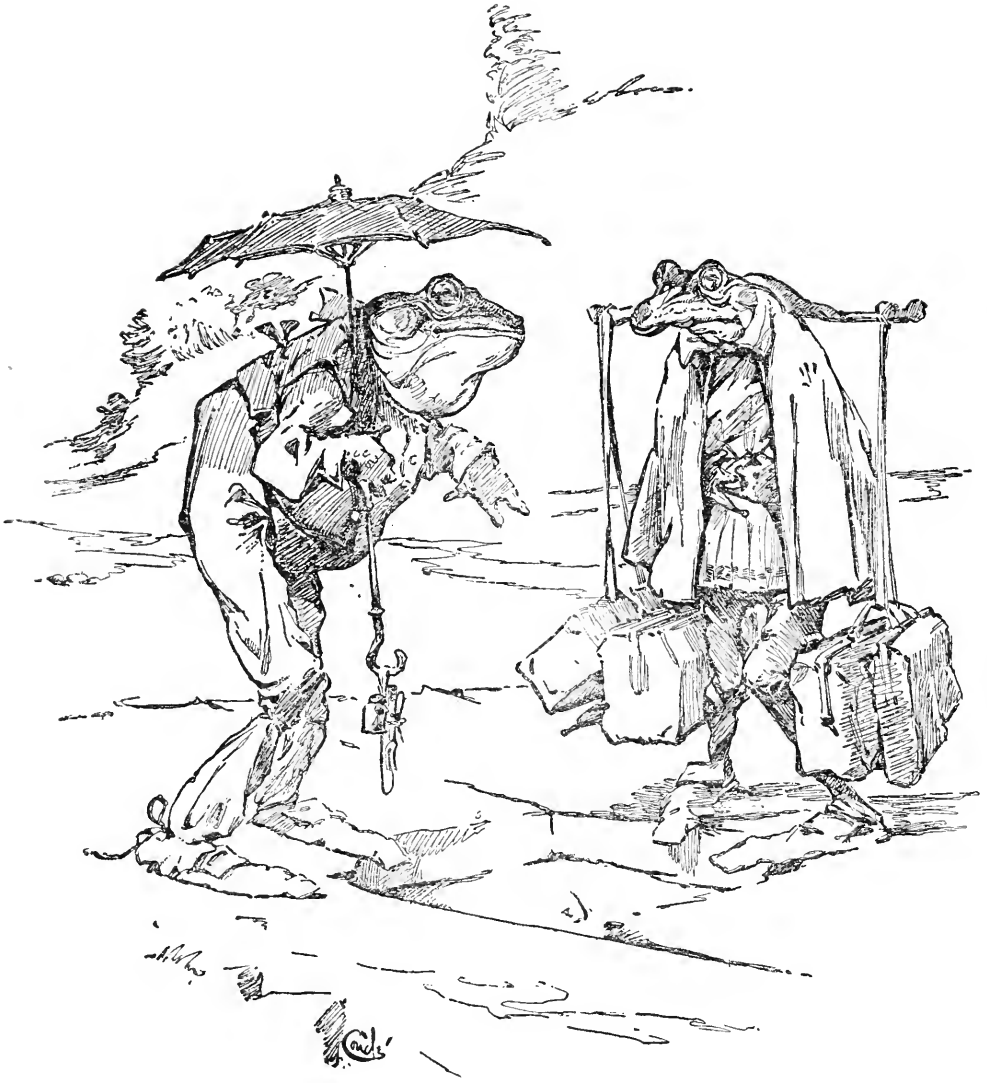
THE TWO FROGS.