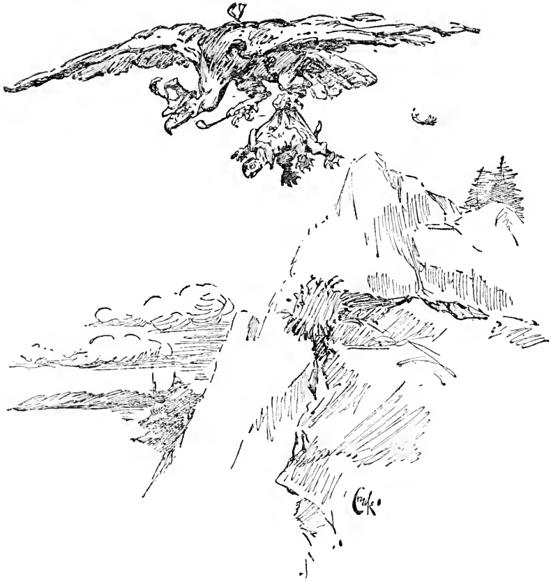
THE TORTOISE AND THE EAGLE