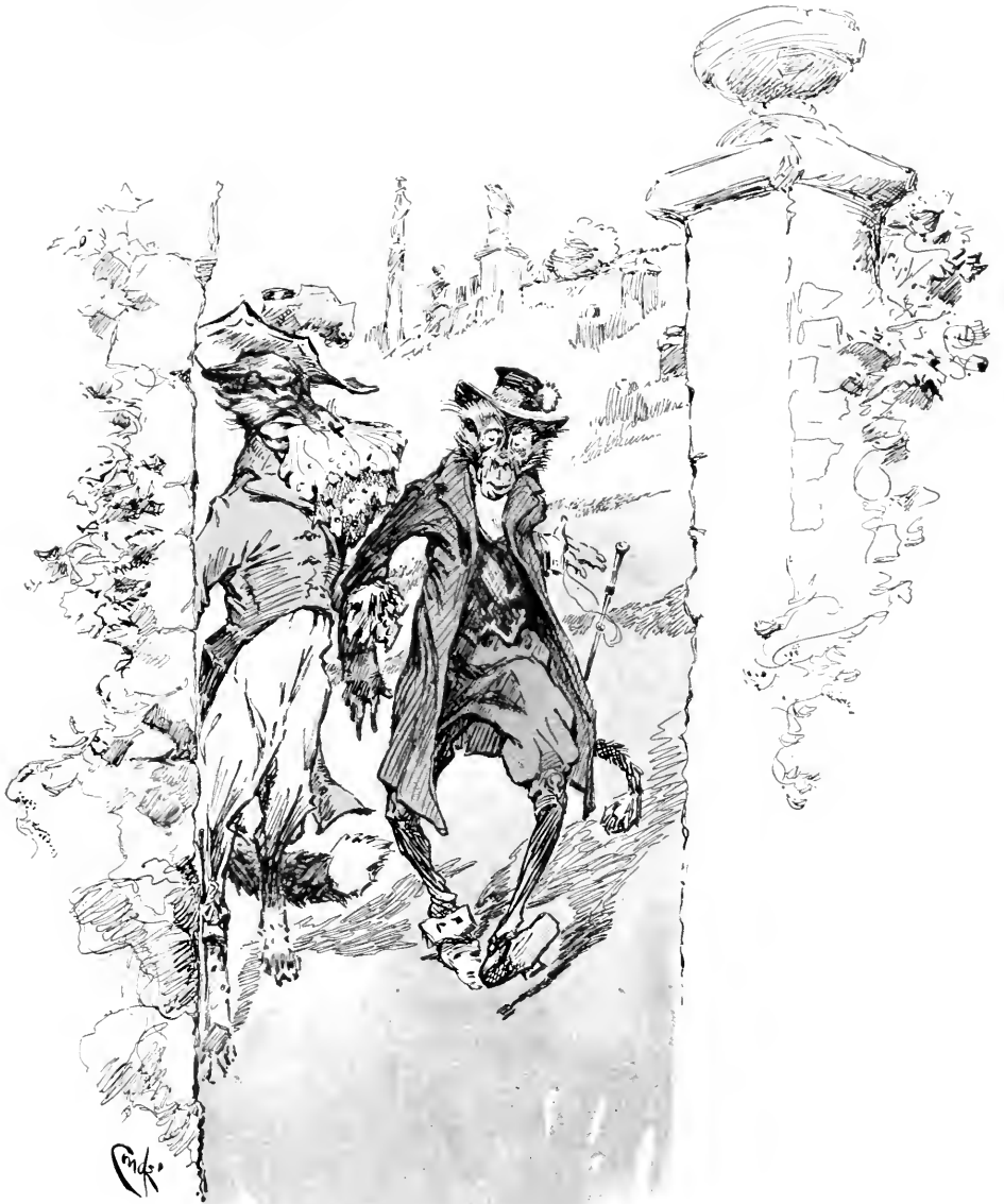
“I Am Sure None of Your Ancestors Will Be Able to Contradict You.” The Fox and the Monkey.