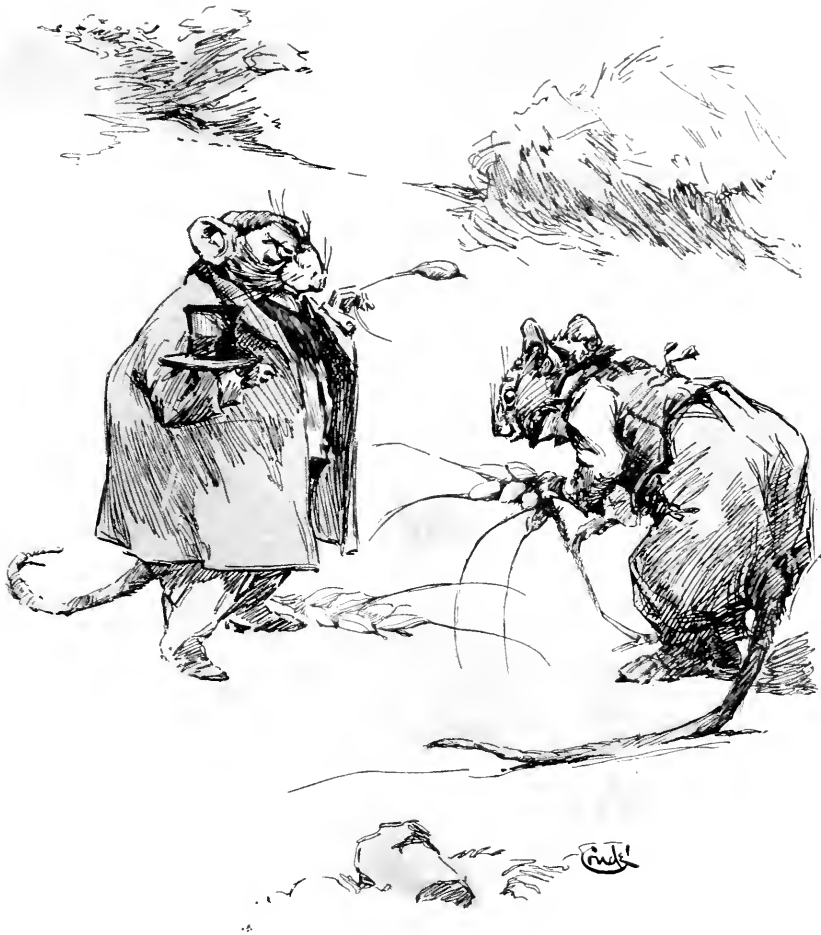
The Town Mouse and the Country Mouse.