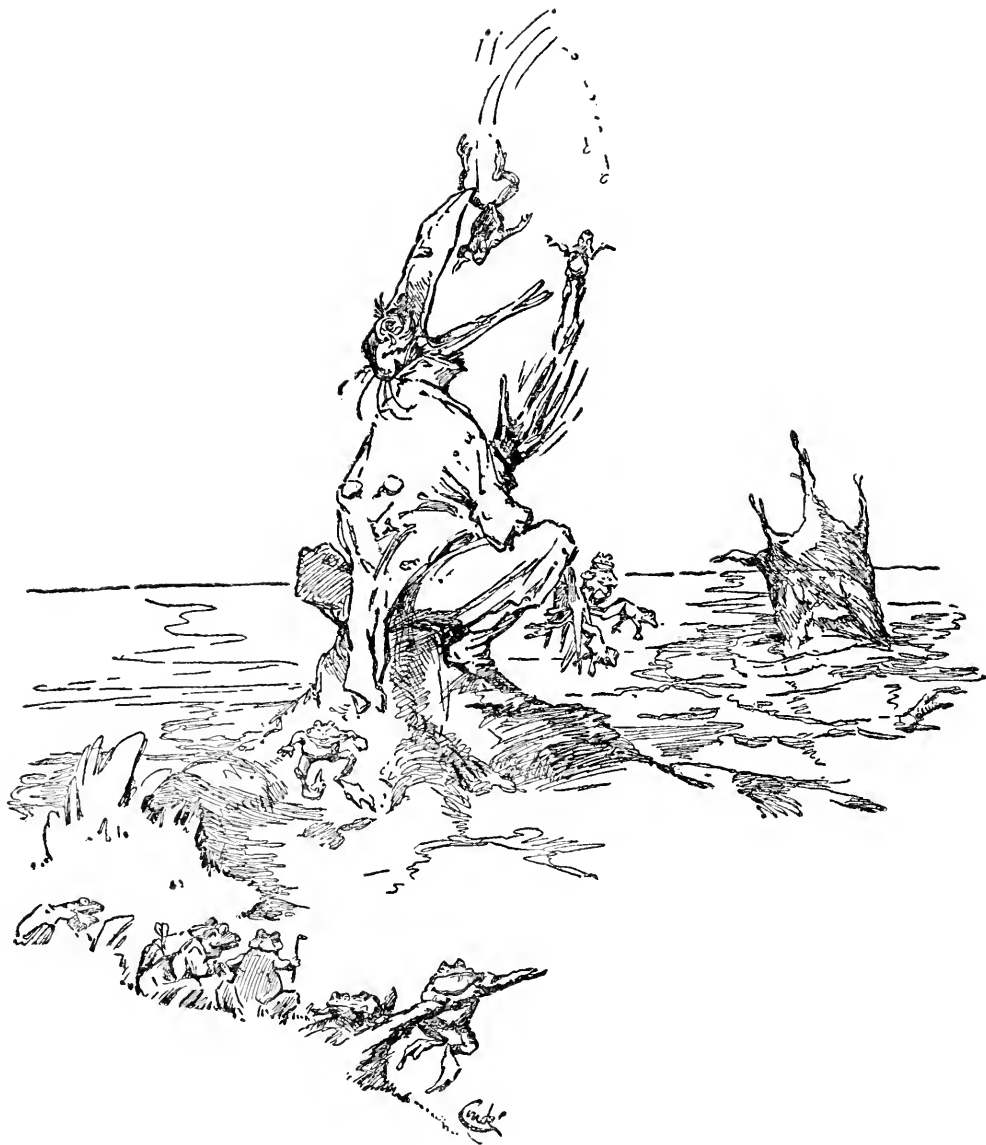
THE FROGS ASKING FOR A KING