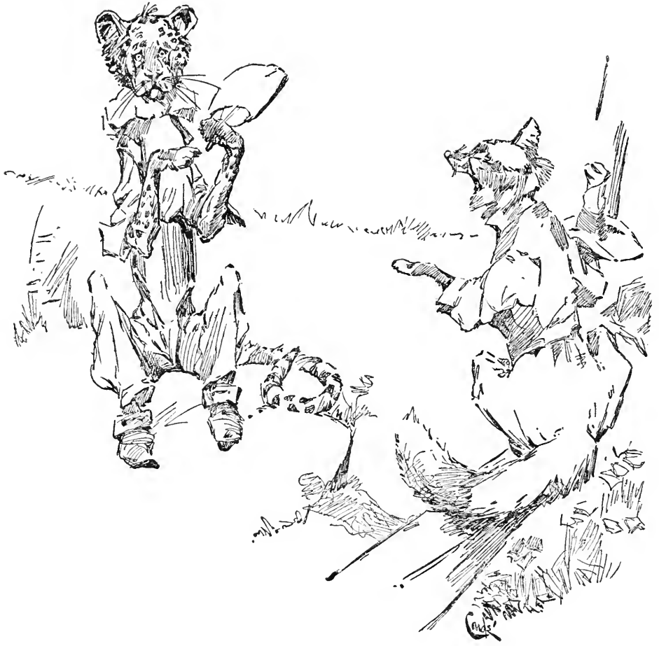
THE FOX AND THE LEOPARD.