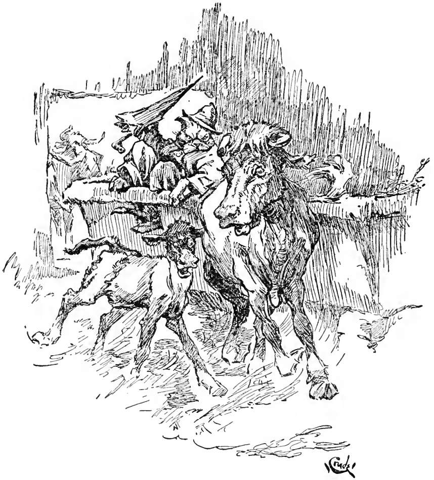
THE DOG IN THE MANGER