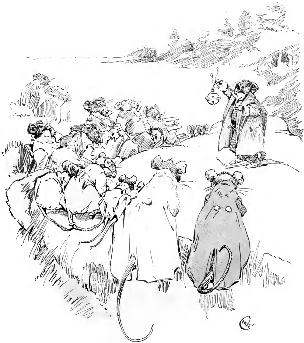
“The Favorite Plan Was to Tie a Bell to the Neck of the Cat.” The Mice in Council.