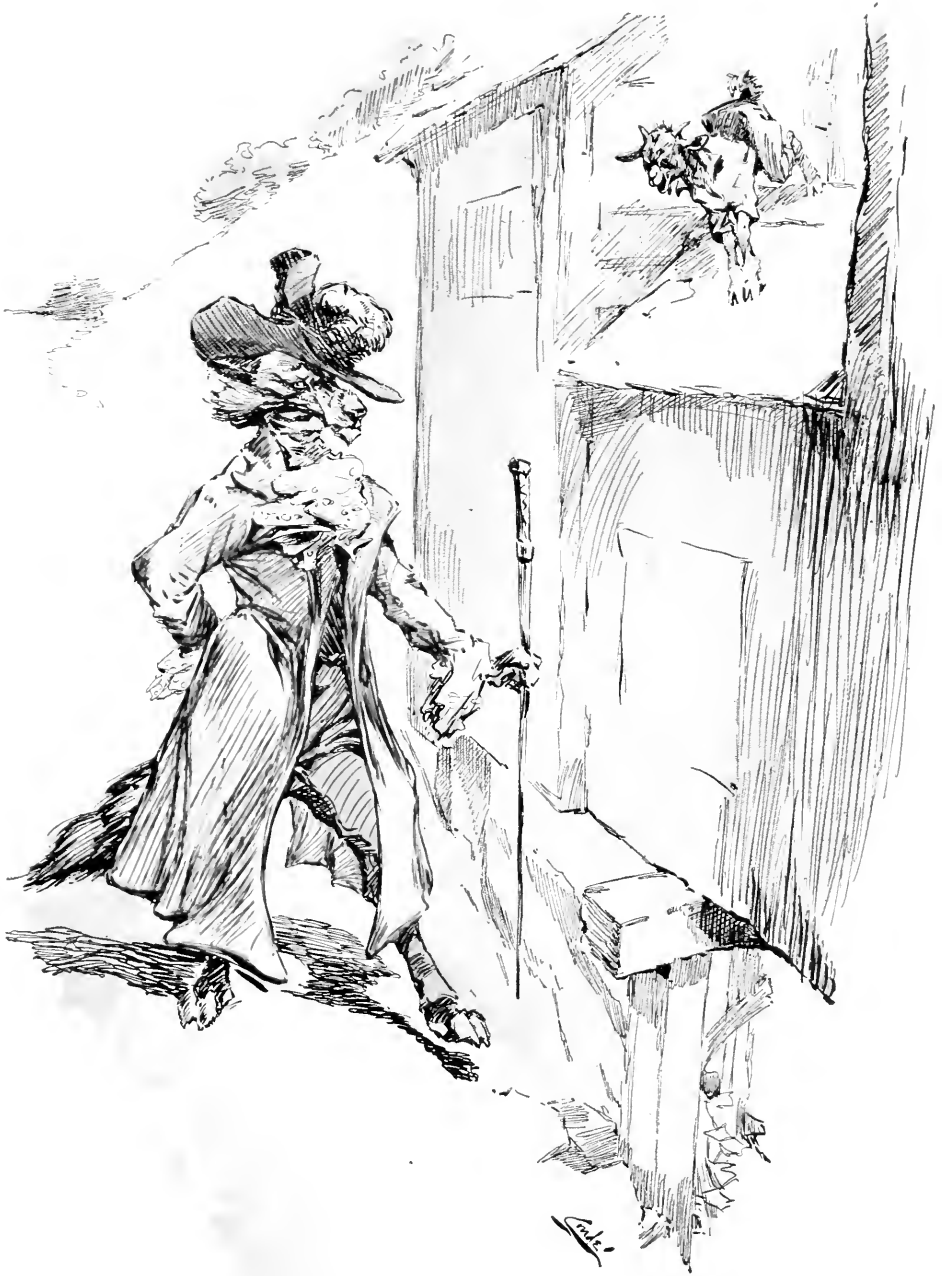
“It Is Not Thou That Mockest Me, but the Roof.” The Kid and the Wolf.