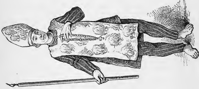
Dress of one condemned to be strangled.