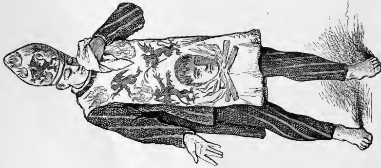
Dress of the Martyr in which he is burnt at the stake