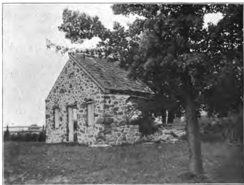
THE TALLEY SCHOOL HOUSE.