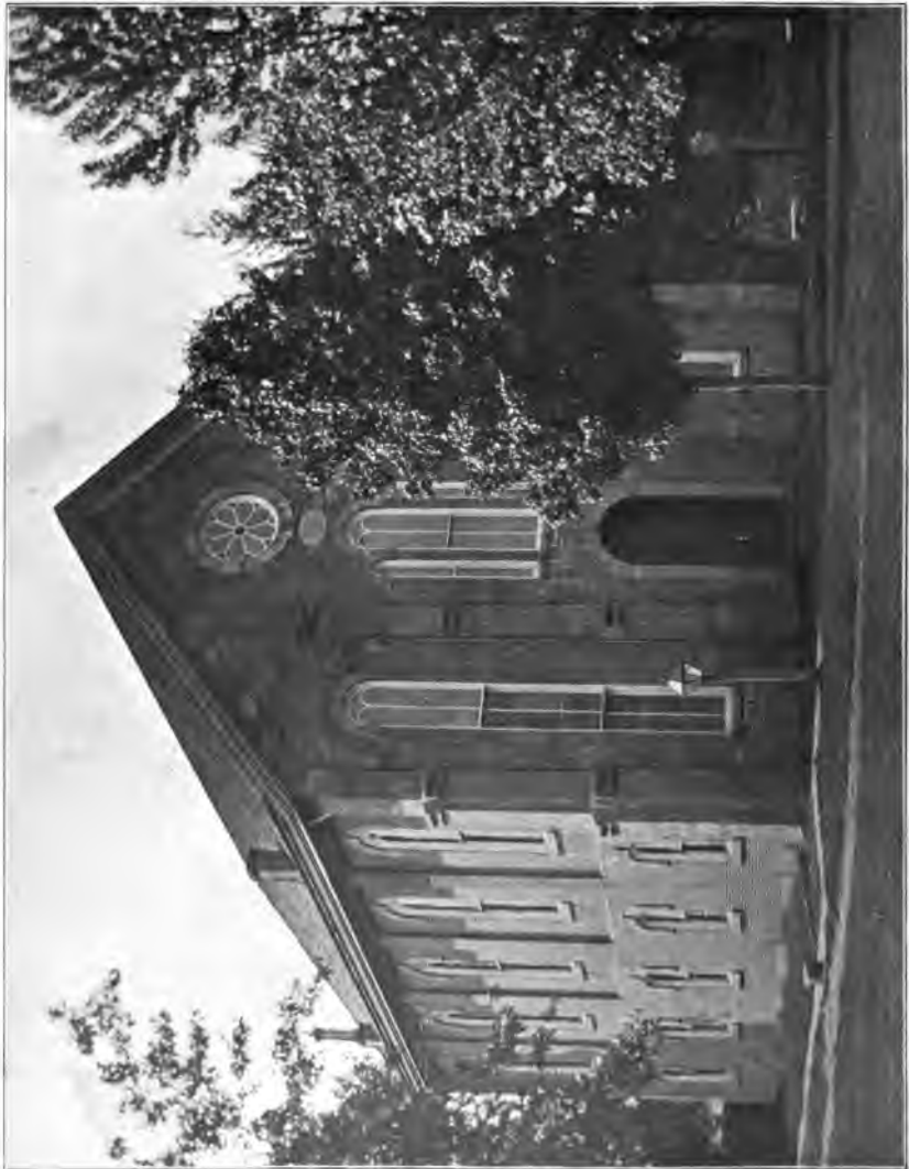
BETHEL M. E. CHURCH.