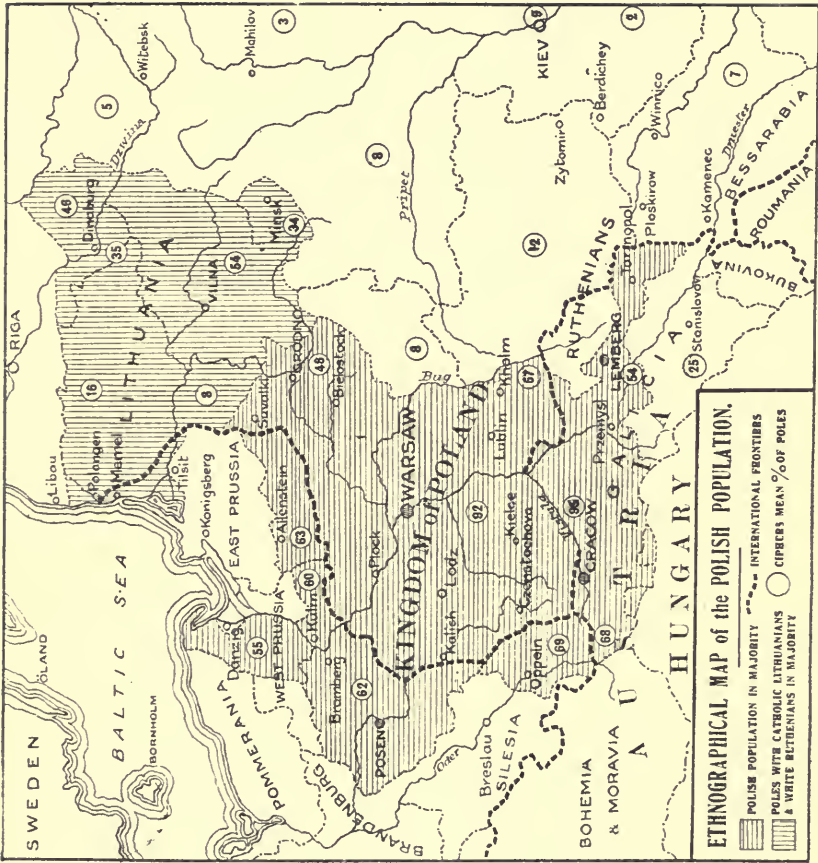
ETHNOGRAPHICAL MAP of the POLISH POPULATION.

[Horizontal hatching] POLES POPULATION IN MAJORITY [Vertical hatching] POLES WITH CATHOLIC LITHUANIANS IN MAJORITY [Diagonal hatching] WHITE RUTHENIANS IN MAJORITY [Dashed line] INTERNATIONAL FRONTIERS [Circle] CIPHERS MEAN % OF POLES