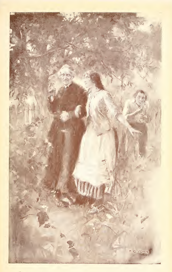
The gowned priest, the fresh-faced and coarsely-clad girl p. 11.