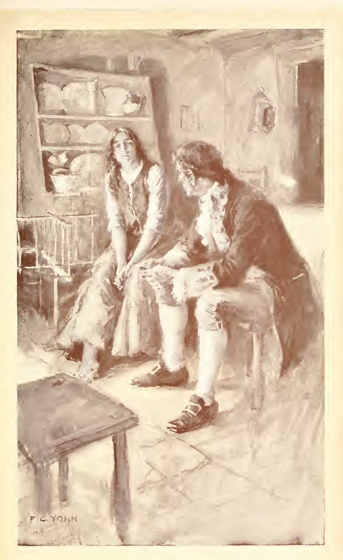
He was just then studying the fine lines of her face p. 129.