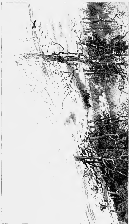
A MOUNTAIN ROAD