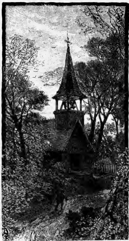
THE CHURCH-BELL ANNOUNCES "EVENING MEETING"