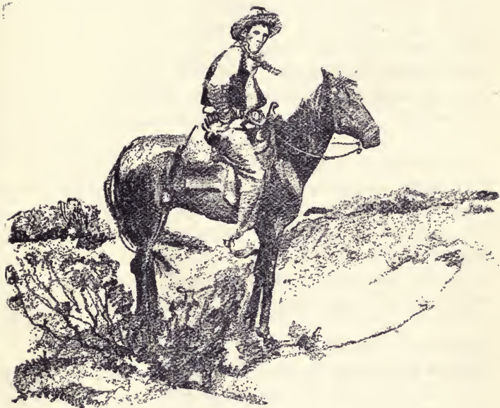
Looming above the horizon.