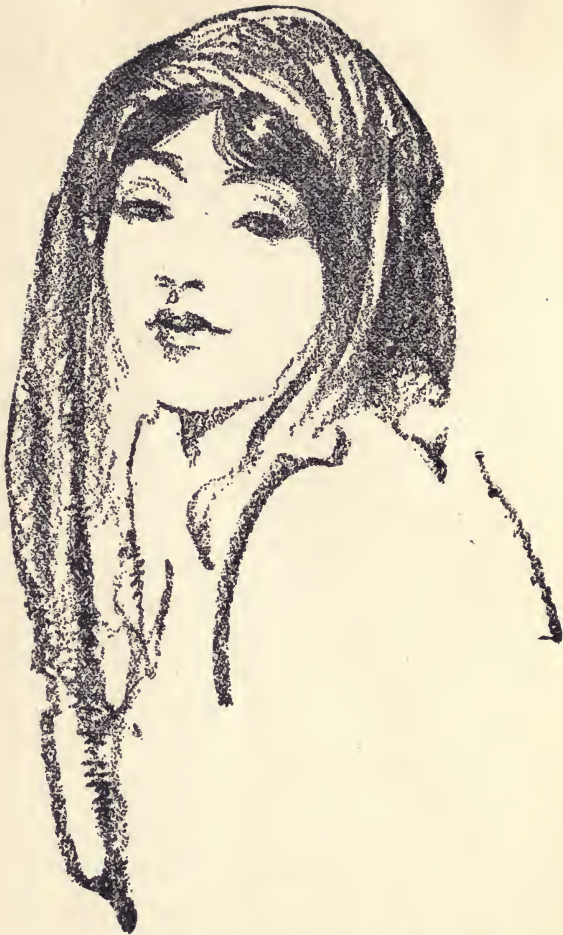
The senorita atones for a multitude of sins.