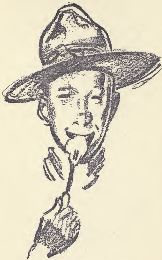
A "starving" militiaman on the border.