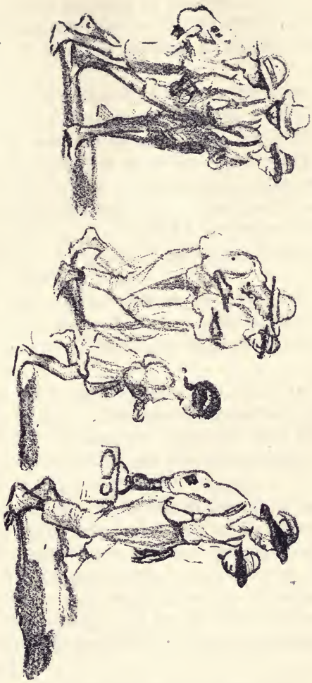
For once he was unconscious of the admiring group of seven that followed him up the street.