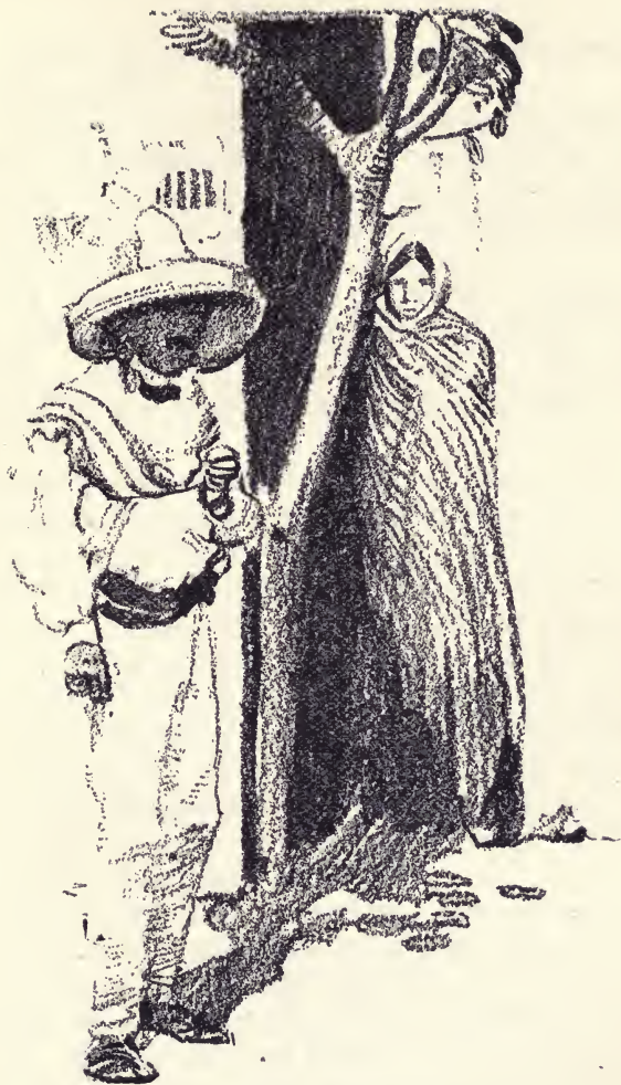
Some stopped and stared at us.