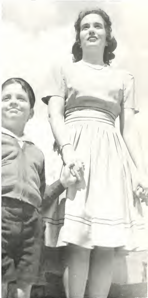
TEACHER AND PUPIL—CURRY SCHOOL