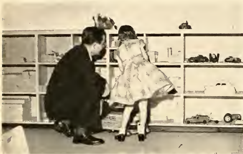
Three and four year olds keep wonderful toys right at hand.