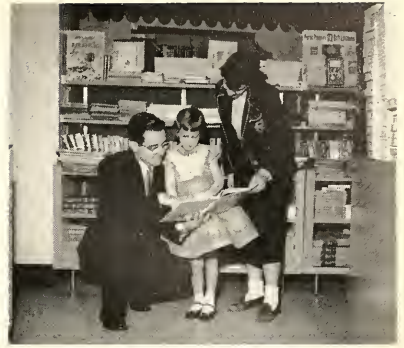
Pinochio and Plato rest on bookstore shelves.