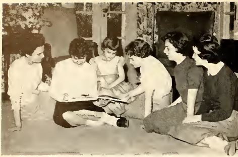
Jamison girls love to hostess, and The Pine Needles makes a good "come on."