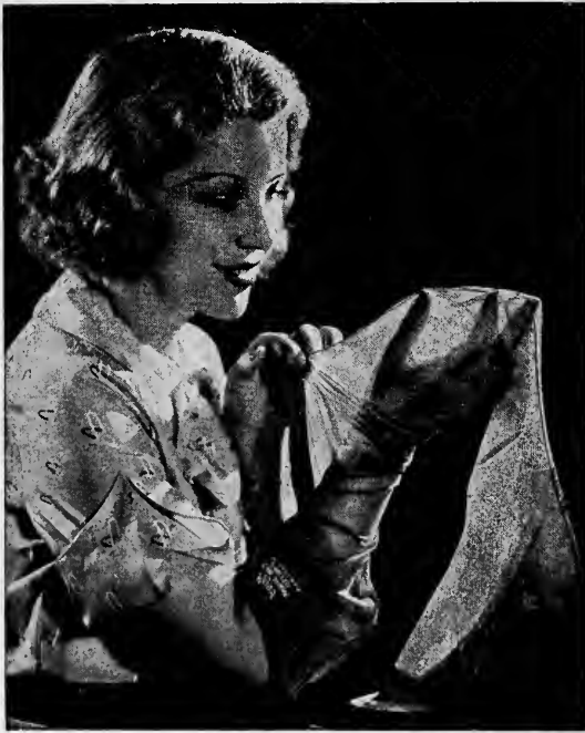
GLEND A FARRELL, star of Warner Bros. picture "Miss Pacific Fleet," admires the crystal clearness of her Mojud Clari-phane silk stockings.