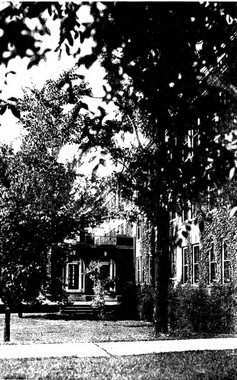
View of Gray Dormitory